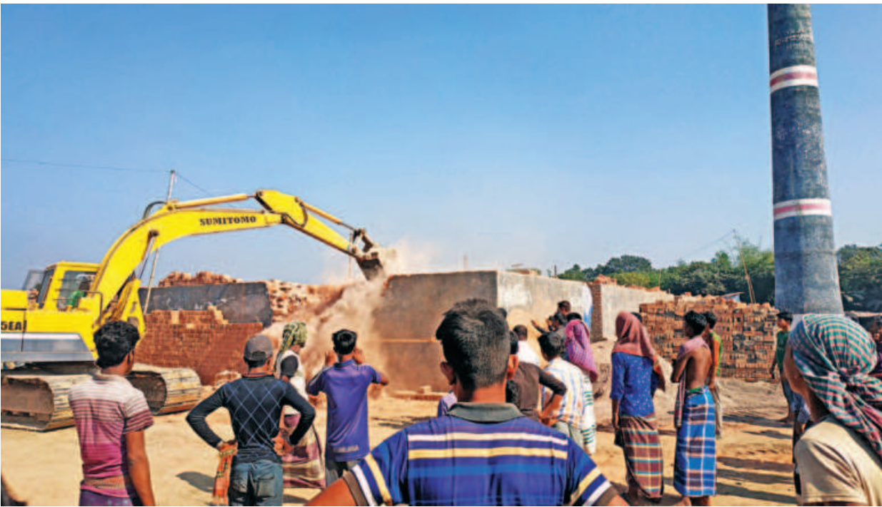
An illegal brick kiln being dismantled by the Department of Environment in Dhamrai yesterday.