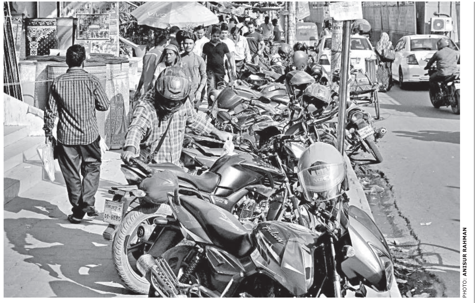
IT'S NOT A PARKING LOT! A man parks his motorbike on a sidewalk, following the cue of many others before him. Such illegal parking often leaves a narrow passage for pedestrians to walk. The photo was taken near the north gate of Baitul Mukarram National Mosque recently.