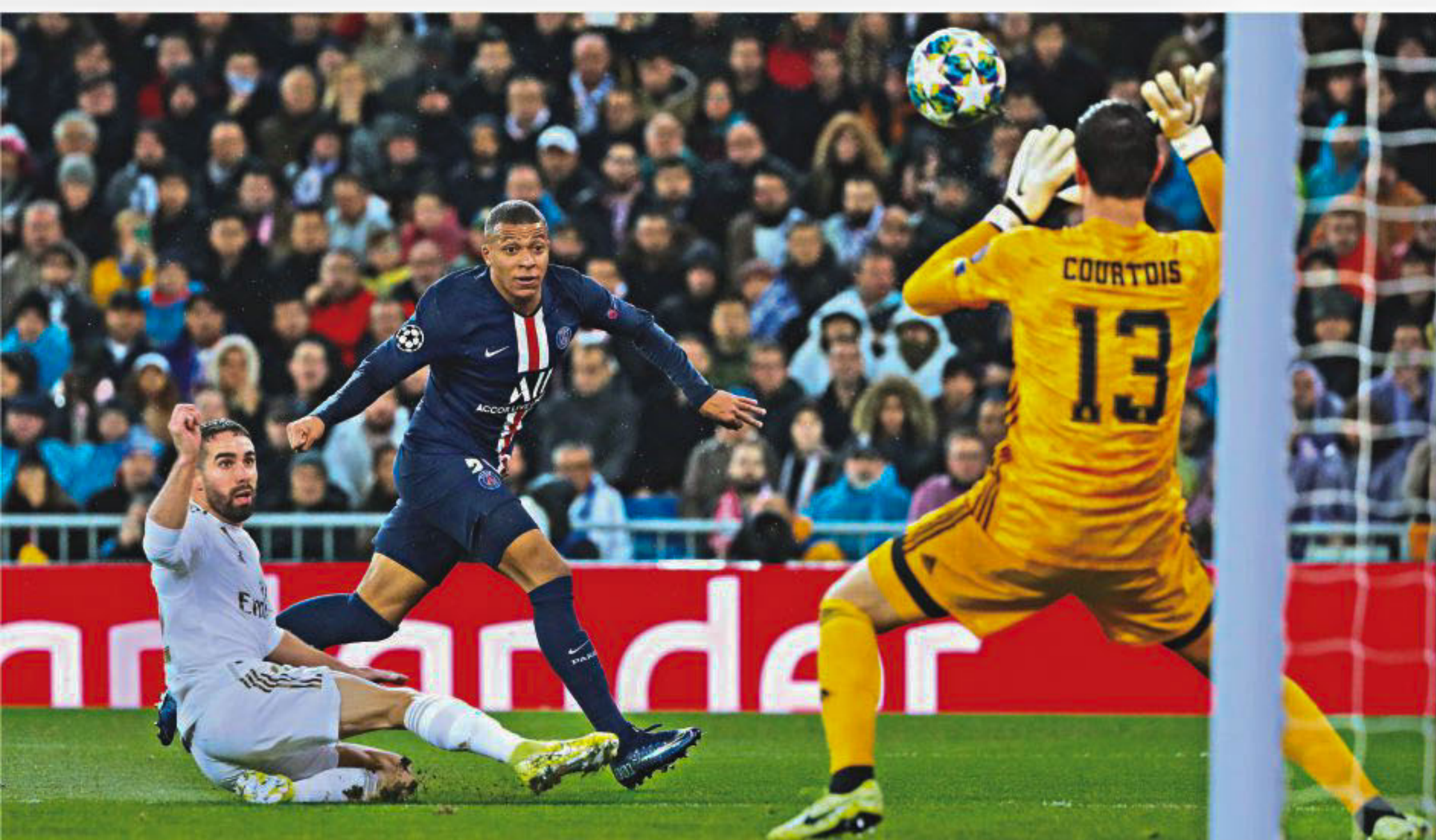
Paris Saint-Germain star Kylian Mbappe (C) takes a shot during their Champions League encounter against Real Madrid at the Bernabeu on Tuesday. Mbappe scored once as PSG came from behind to hold Real to a 2-2 draw.

SONY SIX Europa League Sporting v PSV Live from 12:00am (Friday)