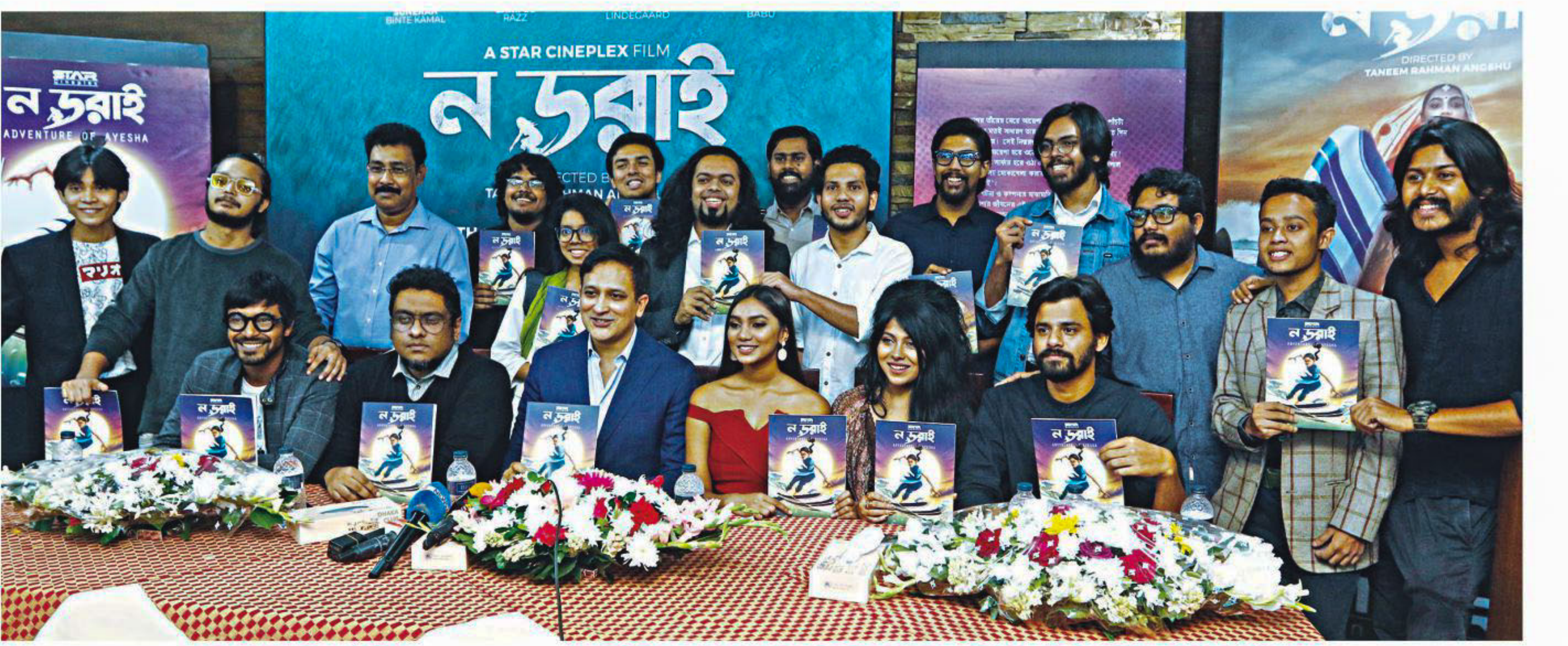
The Cartoon People posing with the team of 'No Dorai'.