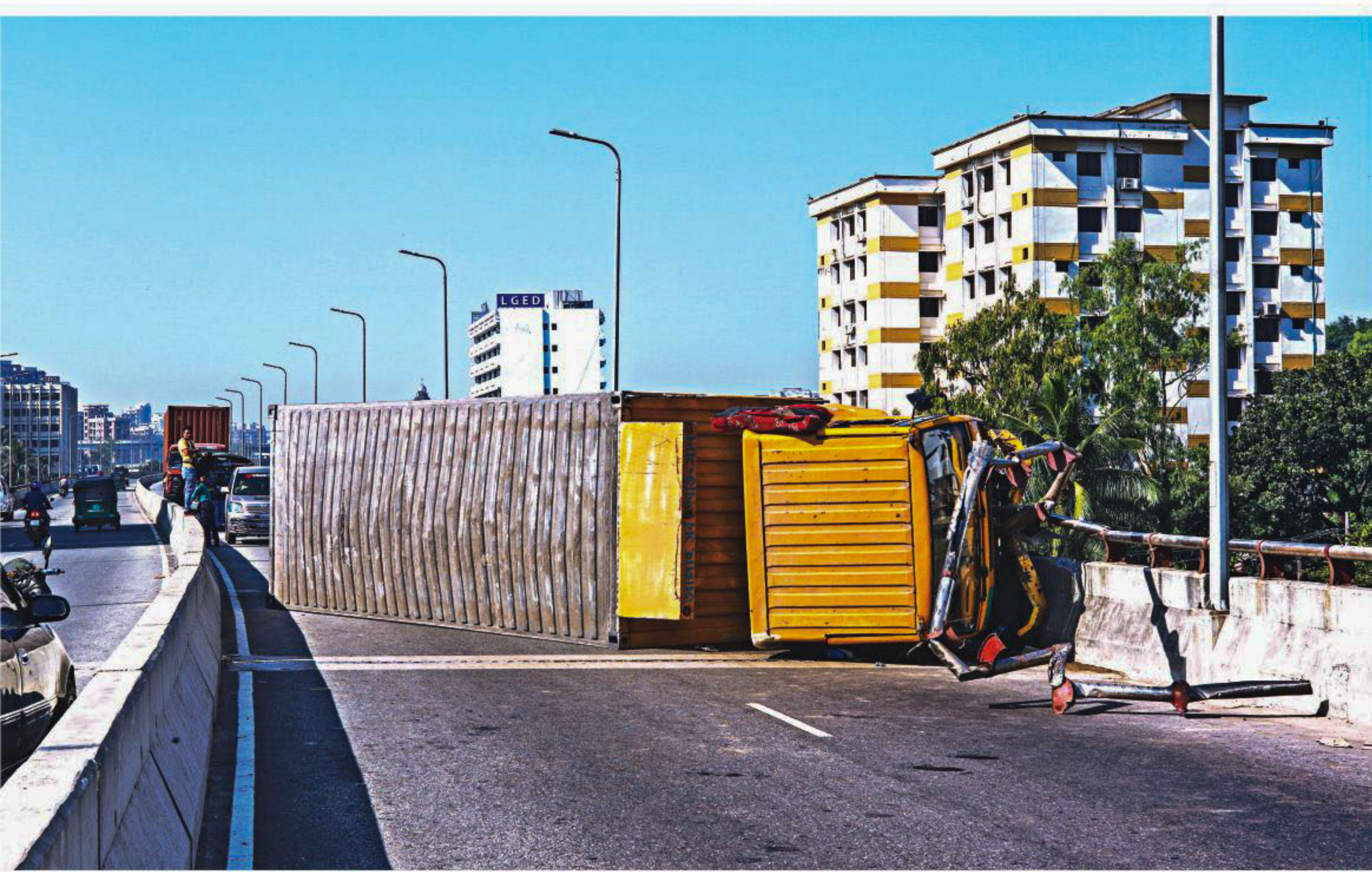
This covered van overturned on Akhtaruzzaman flyover in Chattogram city yesterday morning, reportedly while overtaking a CNG-driven auto-rickshaw. The auto-rickshaw driver was injured in the accident, while the van was moved a few hours later by police, resuming traffic movement on the flyover.