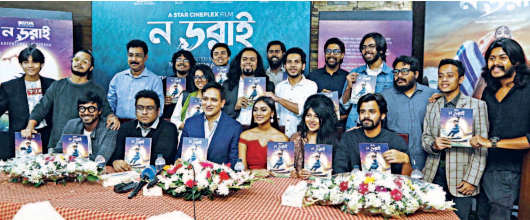
The Cartoon People posing with the team of 'No Dorai'.

Star Melodies Title: Shorogujer Paanch Sabyasachi Sangeet Shroshtha's Gaan Venue: The Daily Star Centre, Kazi Nazrul Islam Ave Date: November 30 Time: 6 pm