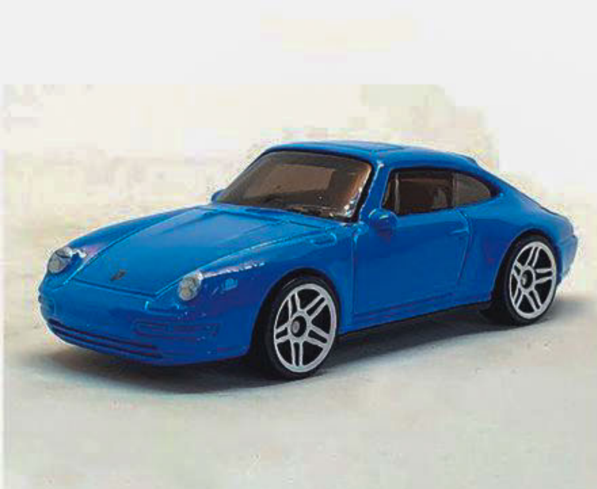
Porsche 911 Carrera Perfect base for RWB inspired customs? With a bit of modelling putty, yes.