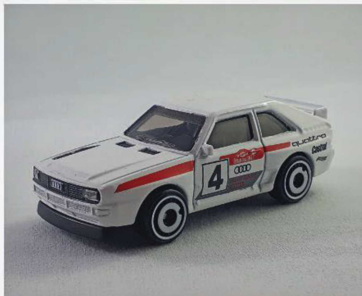
Audi Sport Quattro Legendary Group B racer—turn your living room carpet into a Finnish rally stage.