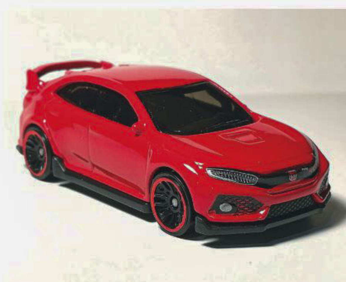
Honda Civic Type R Last year's hottest hot-hatch finally makes it in HW form. Now all you need is a scale Nurburgring to set lap records.