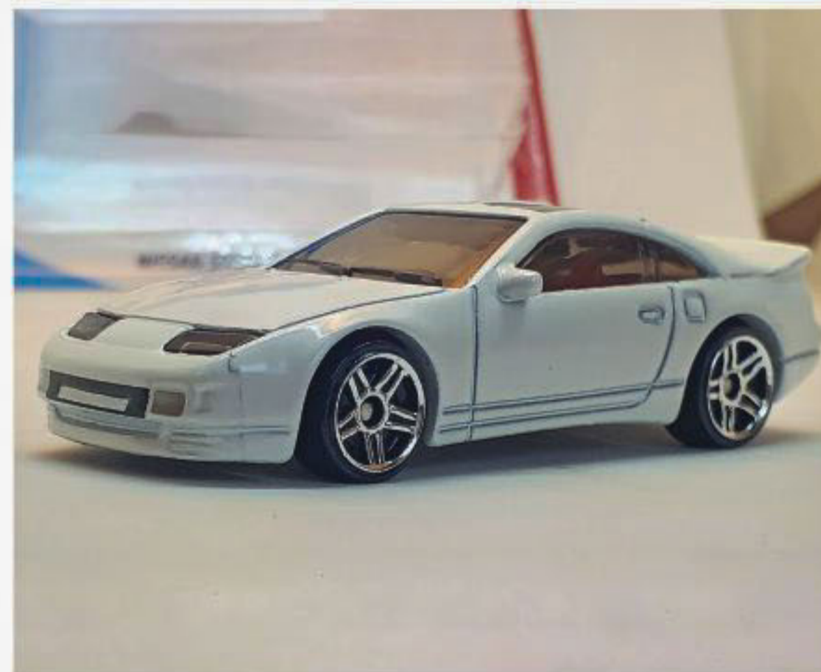
Nissan 300ZX Twin Turbo Don't attempt to take the headlights out and make your own Lambo Diablo VT. That's not how HotWheels work.