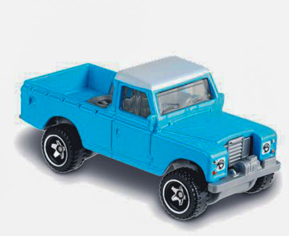
Land Rover Series III Pickup Legendary Land Rover truck. At least this one won't leak oil.