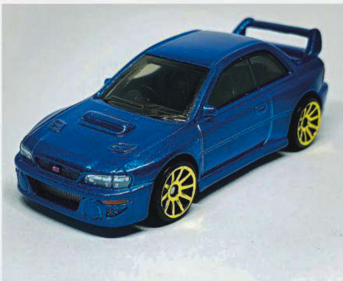
Subaru Impreza 22B Looks a little taller than it should be, but people love it. And with a wheel swap, you will too.