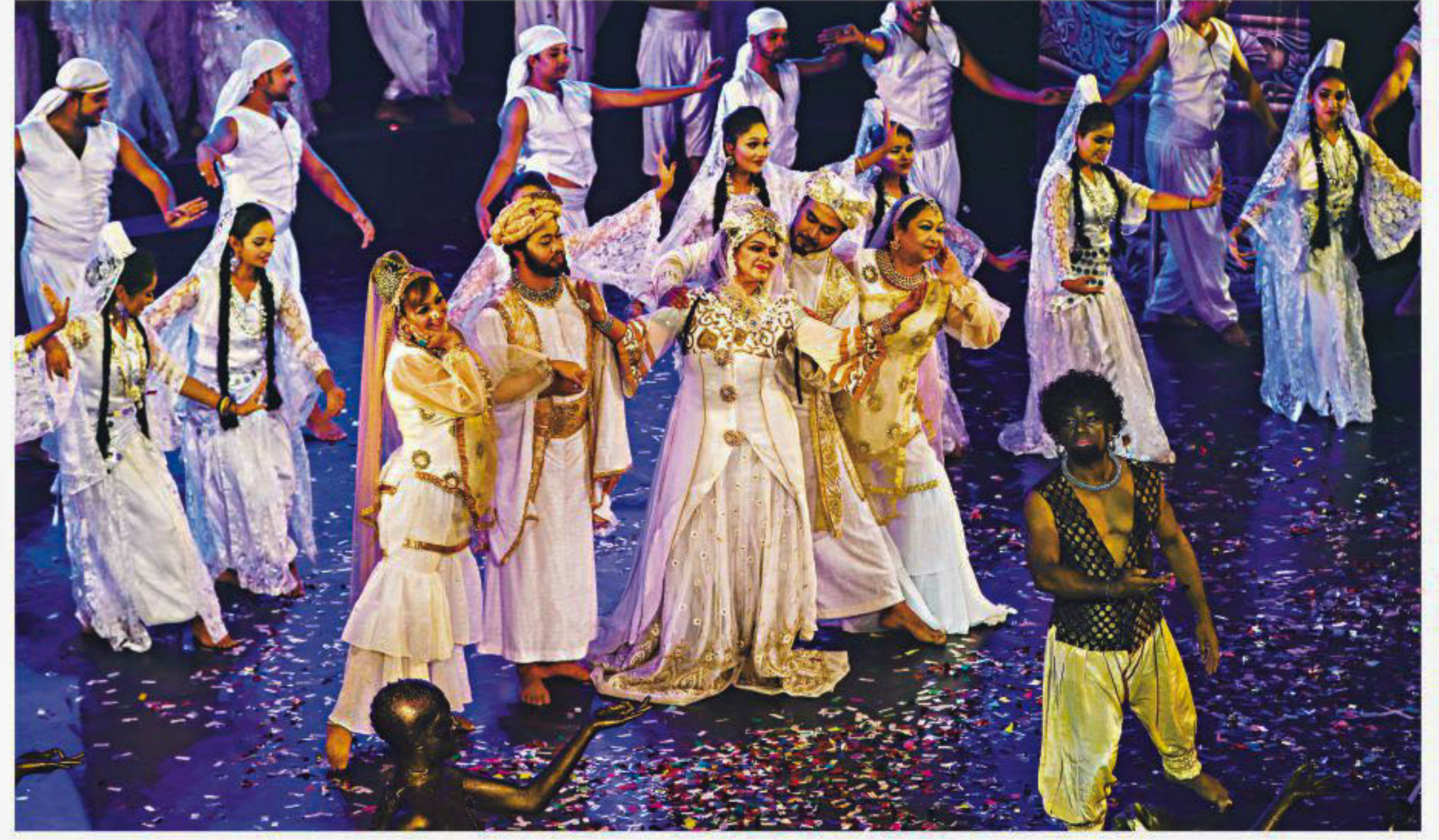
Artistes of Srishti Cultural Centre stage the colourful dance-drama 'Badi-Bandar Rupkatha'.