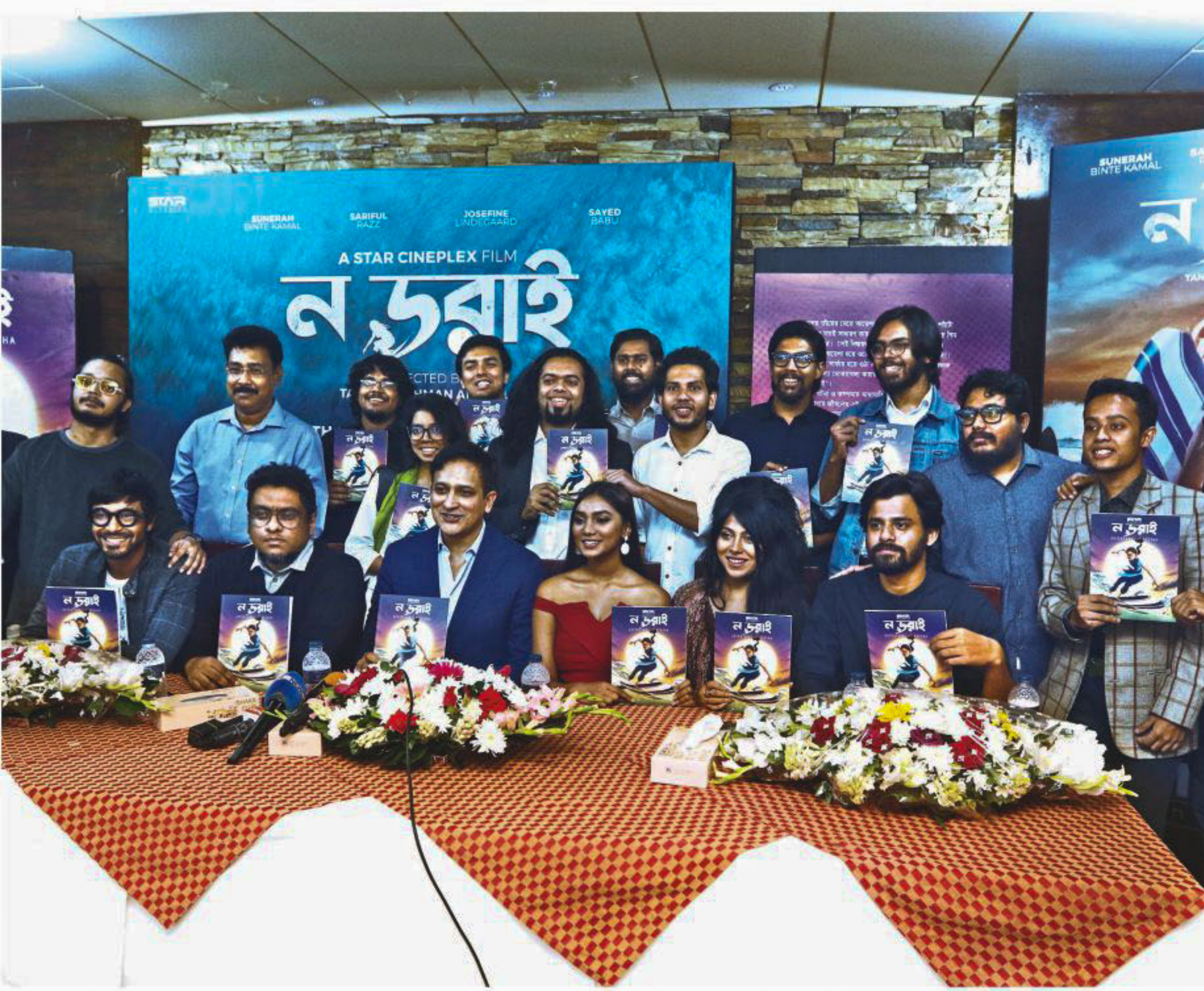
Cast and crew of film "No Dorai" and members of cartoonists' collective Cartoon People at the launch of a comic book based on the film, held at Dhaka Club yesterday. The film, the story of a surfer in Cox's Bazar, is set to release this Friday.