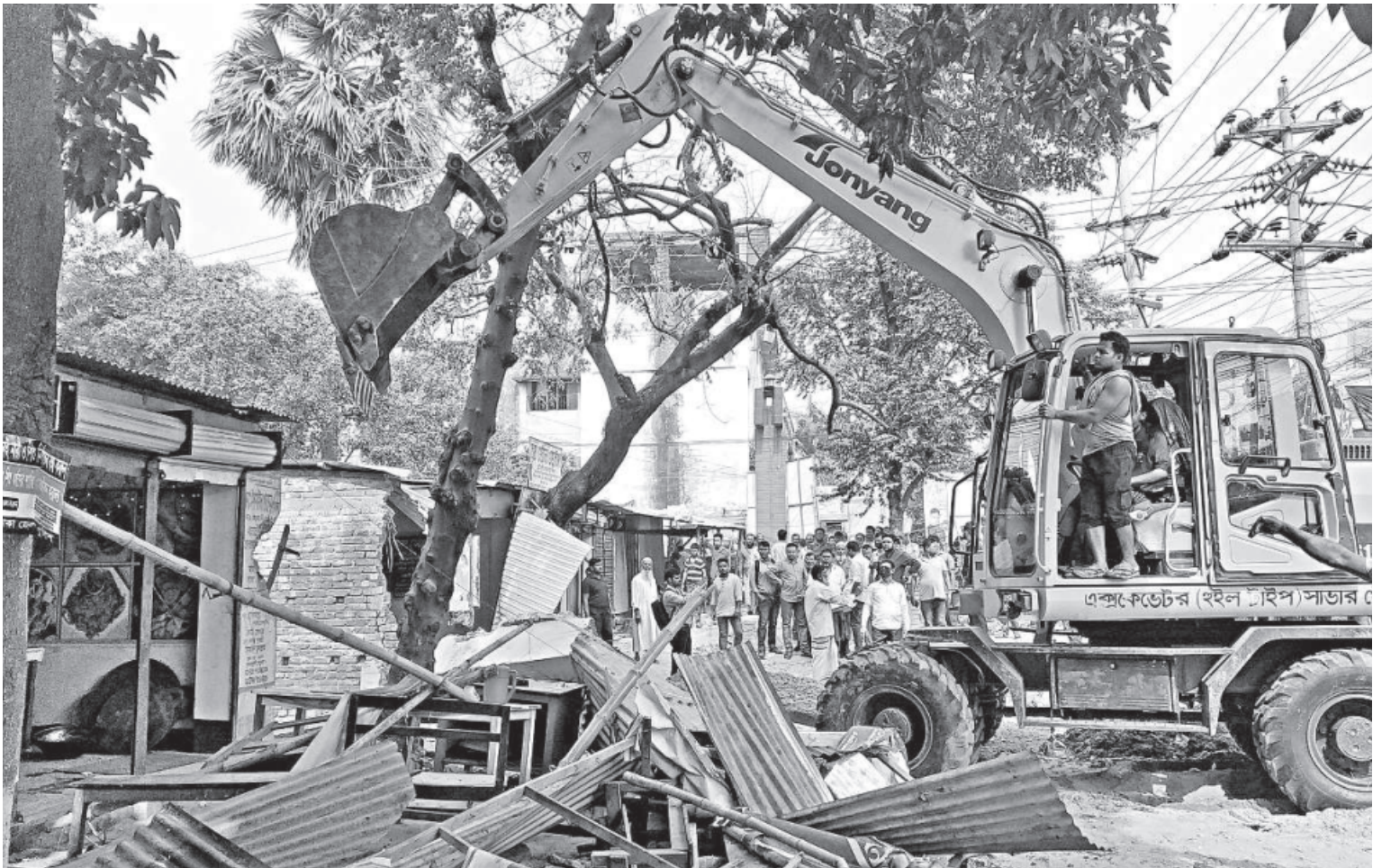
A team of Roads and Highways Department yesterday conducted a drive to knock down illegal structures on both sides of Dhaka-Aricha highway in Savar.