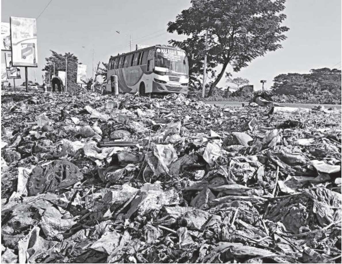
Garbage is regularly dumped on this side of Sylhet-Dhaka highway, leading to Sylhet city. Locals allege city corporation workers are responsible for the mindless act. This photo was taken recently.