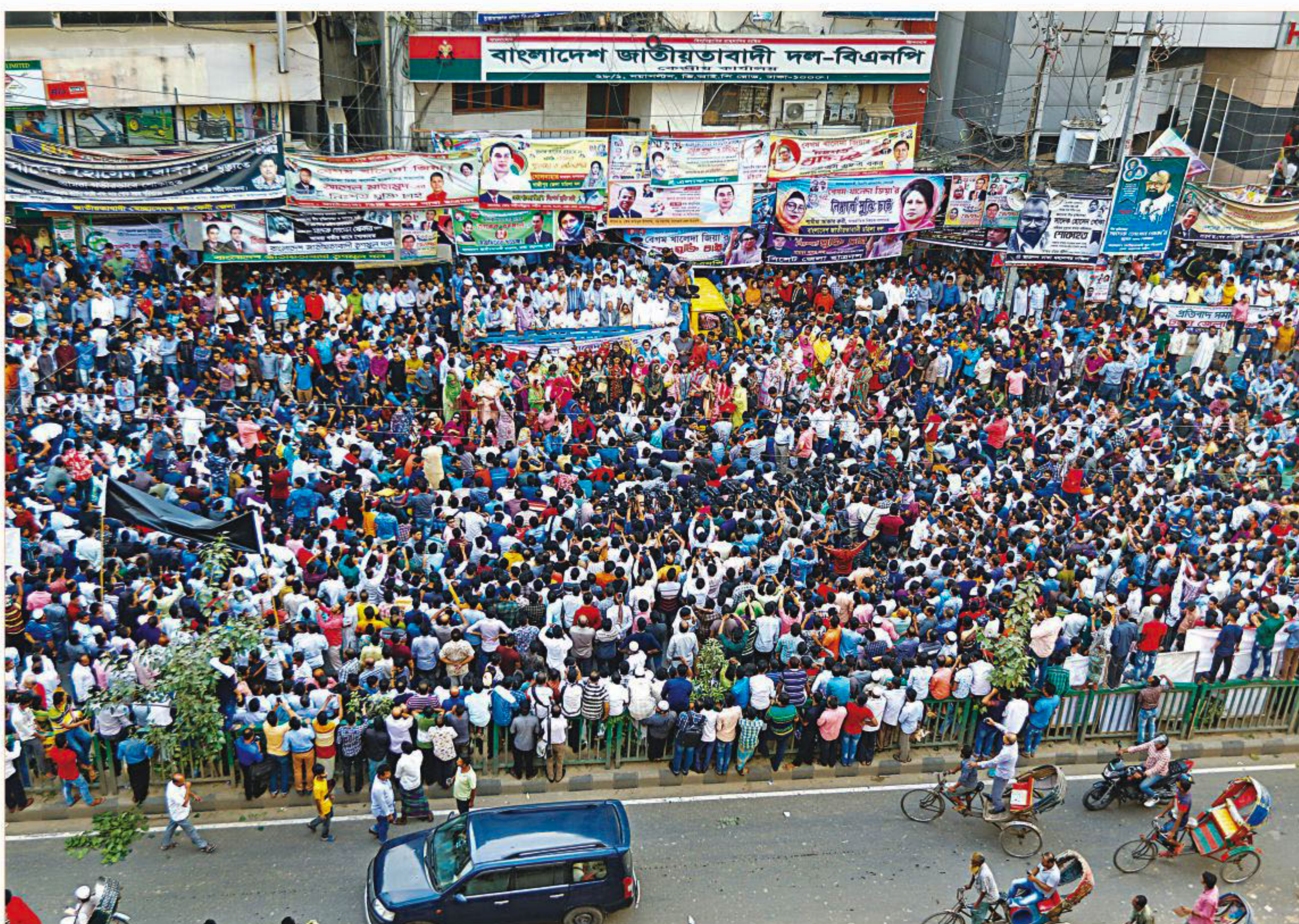
A swarm of people gather at a rally demanding the release of BNP Chairperson Khaleda Zia yesterday in front of the party office in the capital's Nayapaltan.