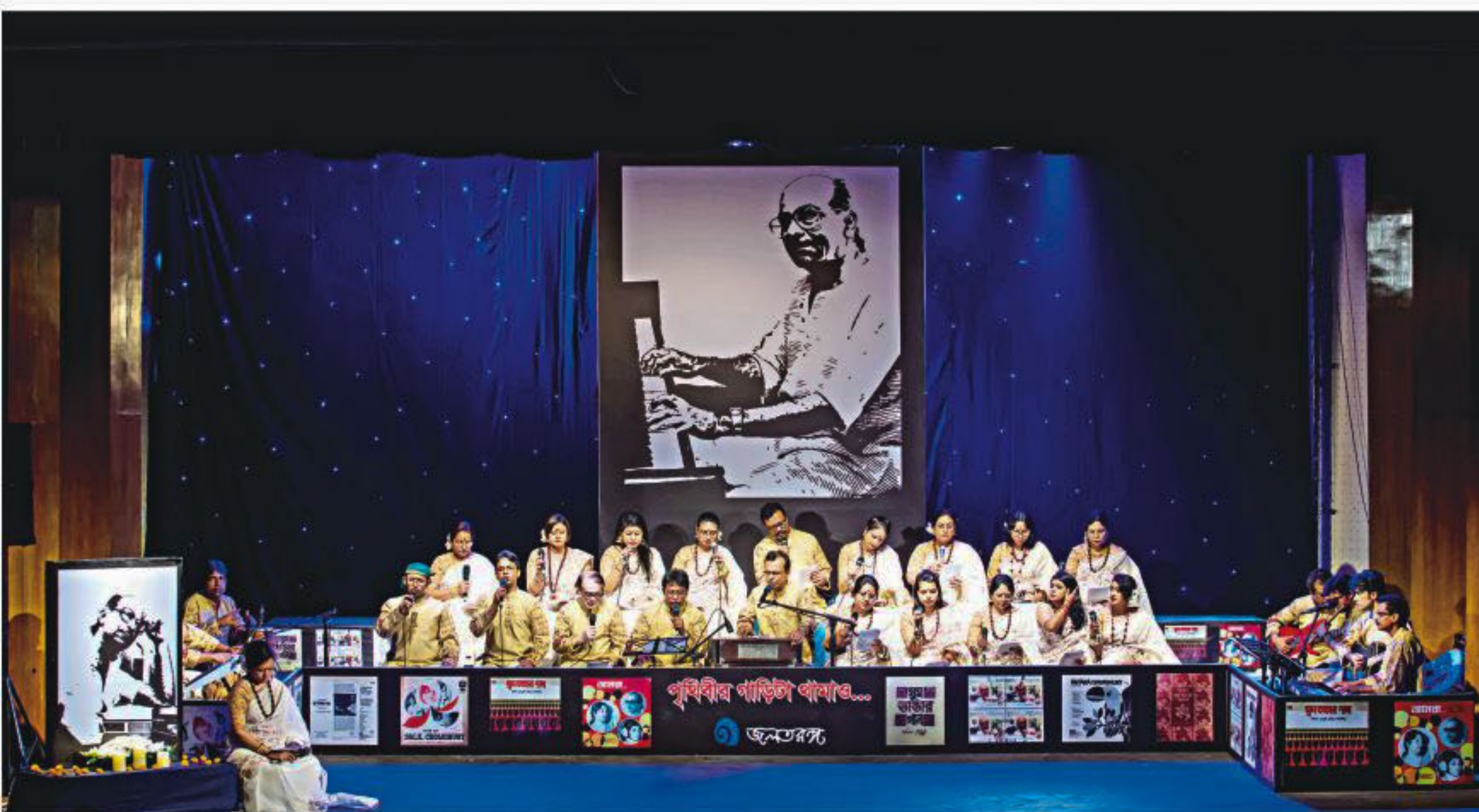
Commemorating the music maestro Salil Chowdhury on his 96th birth anniversary, Jaltaranga, a cultural organisation, arranged a memorable musical evening titled, Prithibir Garita Thamao, at Shawkat Osman Memorial Auditorium, Central Public Library, recently. The artistes of Jaltaranga performed compositions by Chowdhury.