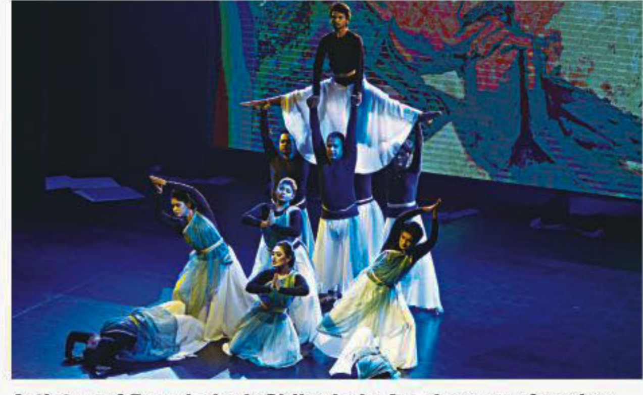
Artistes of Bangladesh Shilpakala Academy performing production 'From Ganges Delta to Bangladesh'