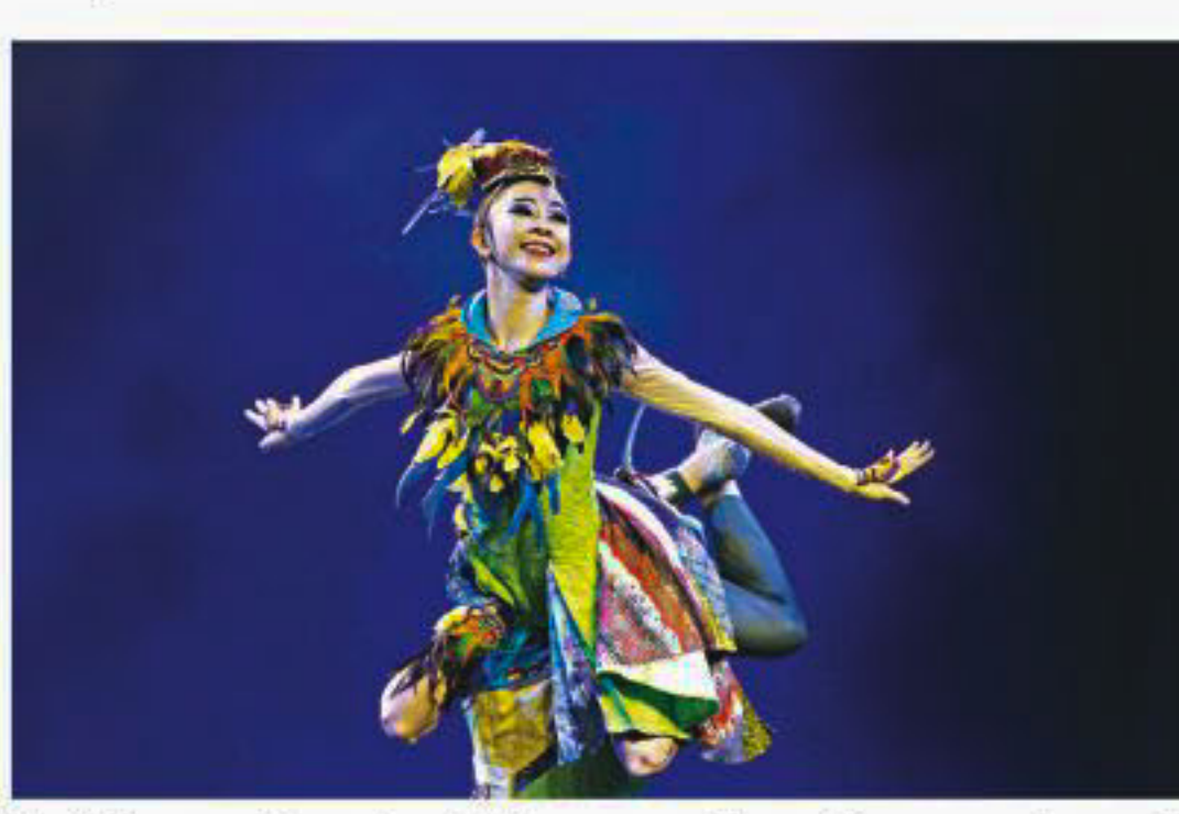
Lei Dance Theatre Taiwan perform 'Impression of our Home Town'