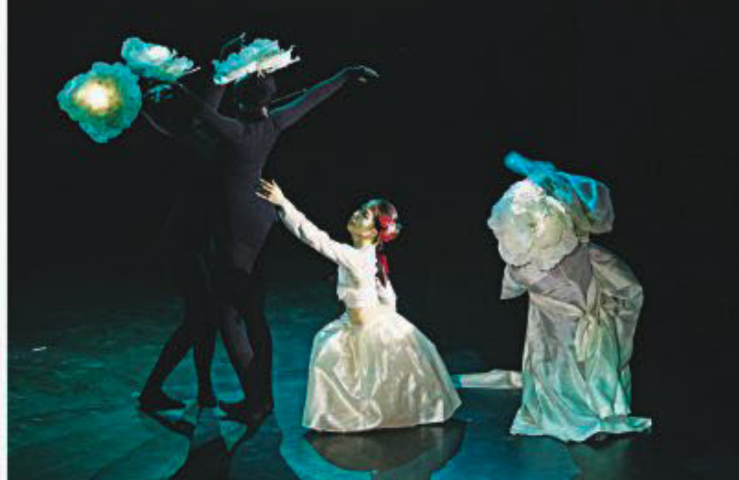
Korean troupe Seojung Dance Company performs 'Spring, coming with warm breeze'