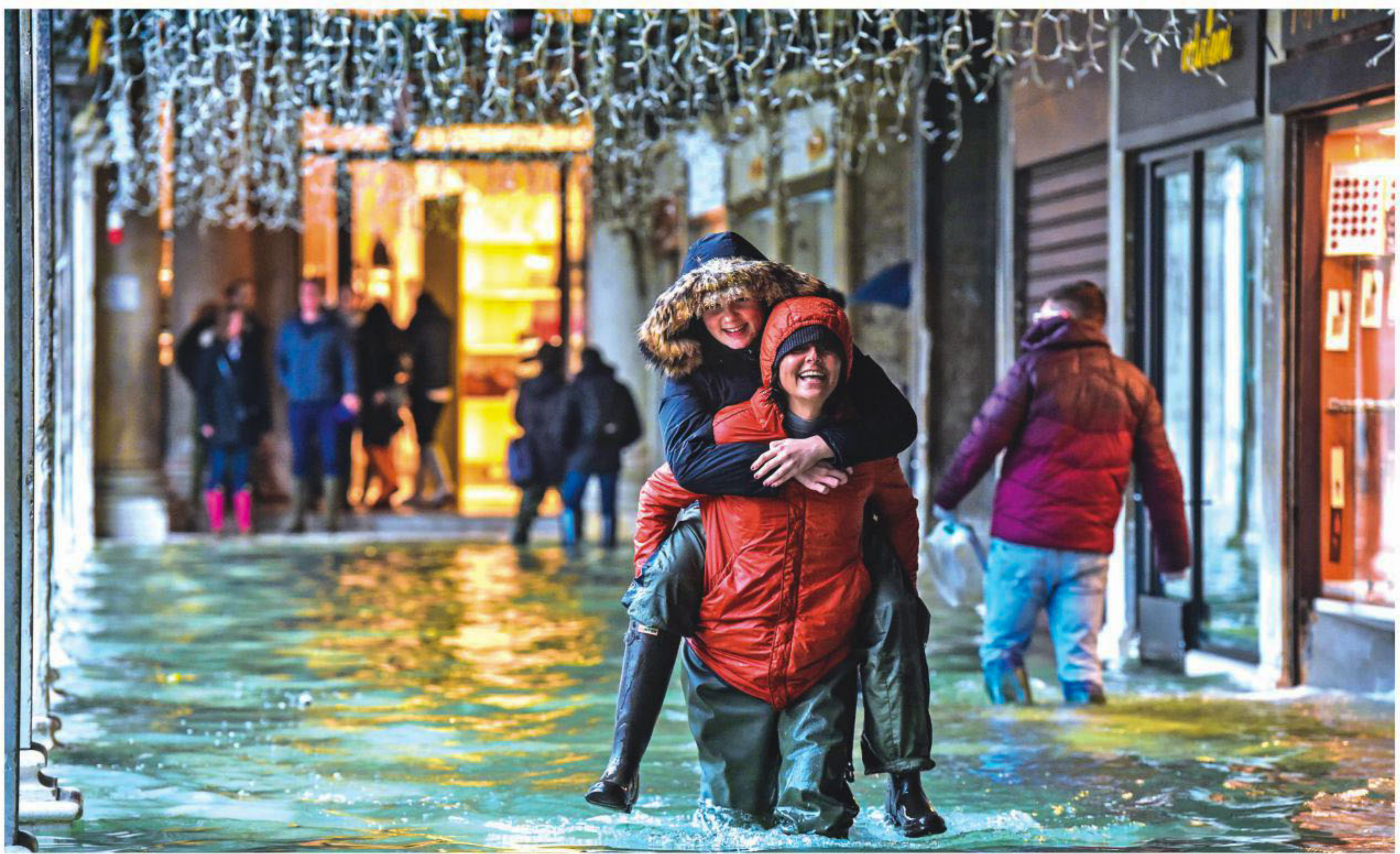
A person carries another across a flooded arcade in Venice yesterday during a high tide "Acqua Alta" meteorological phenomenon. Flood-hit Venice was bracing for another, though smaller, high tide, after Italy declared on November 15 a state of emergency for the Unesco city where perilous deluges have caused millions of euros worth of damage.