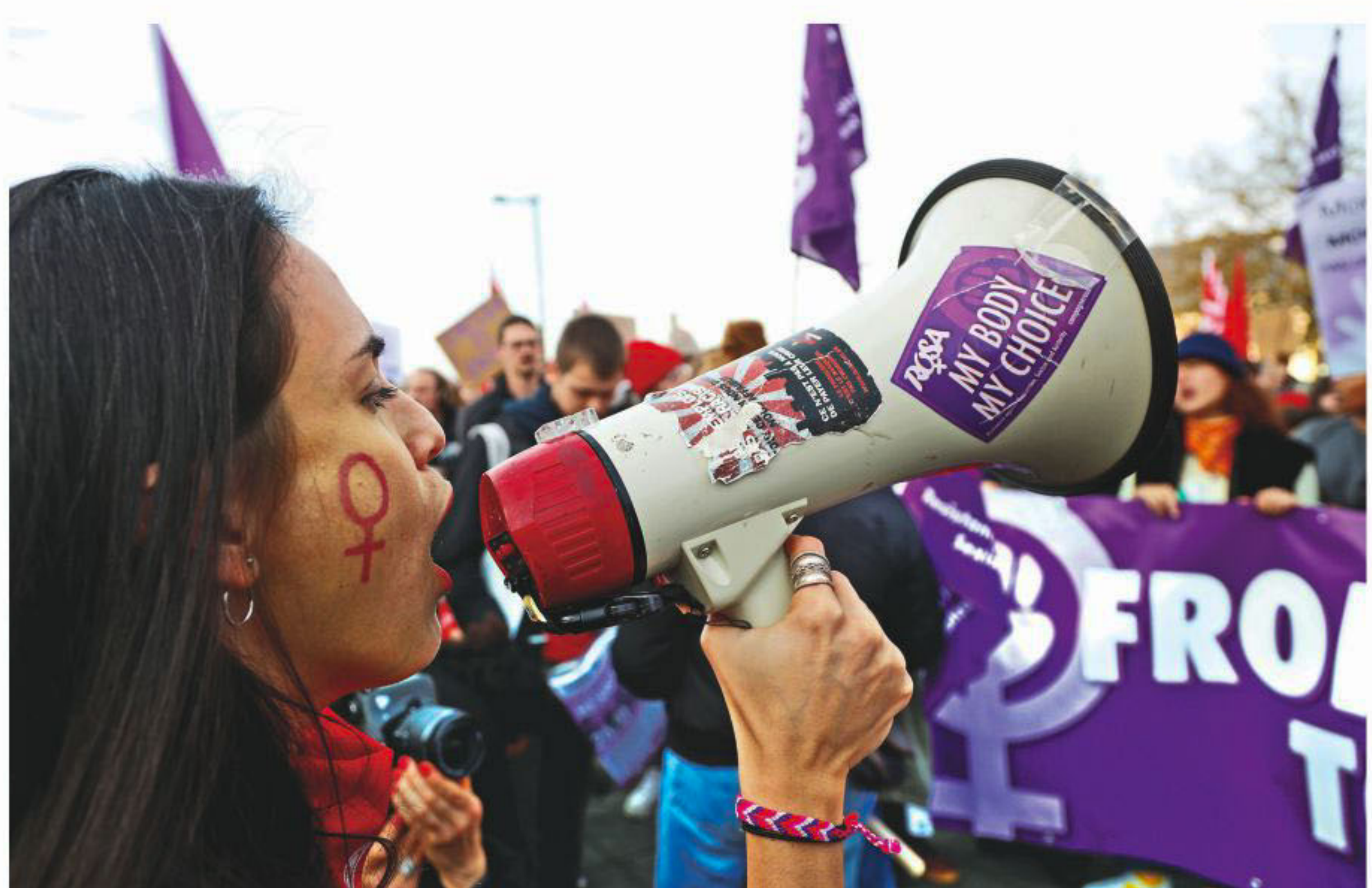
A protester uses a megaphone during a demonstration against all kinds of violence towards women in central Brussels, Belgium, yesterday. Cities around the world today will mark the International Day for Elimination of Violence against Women with rallies and call for equality.