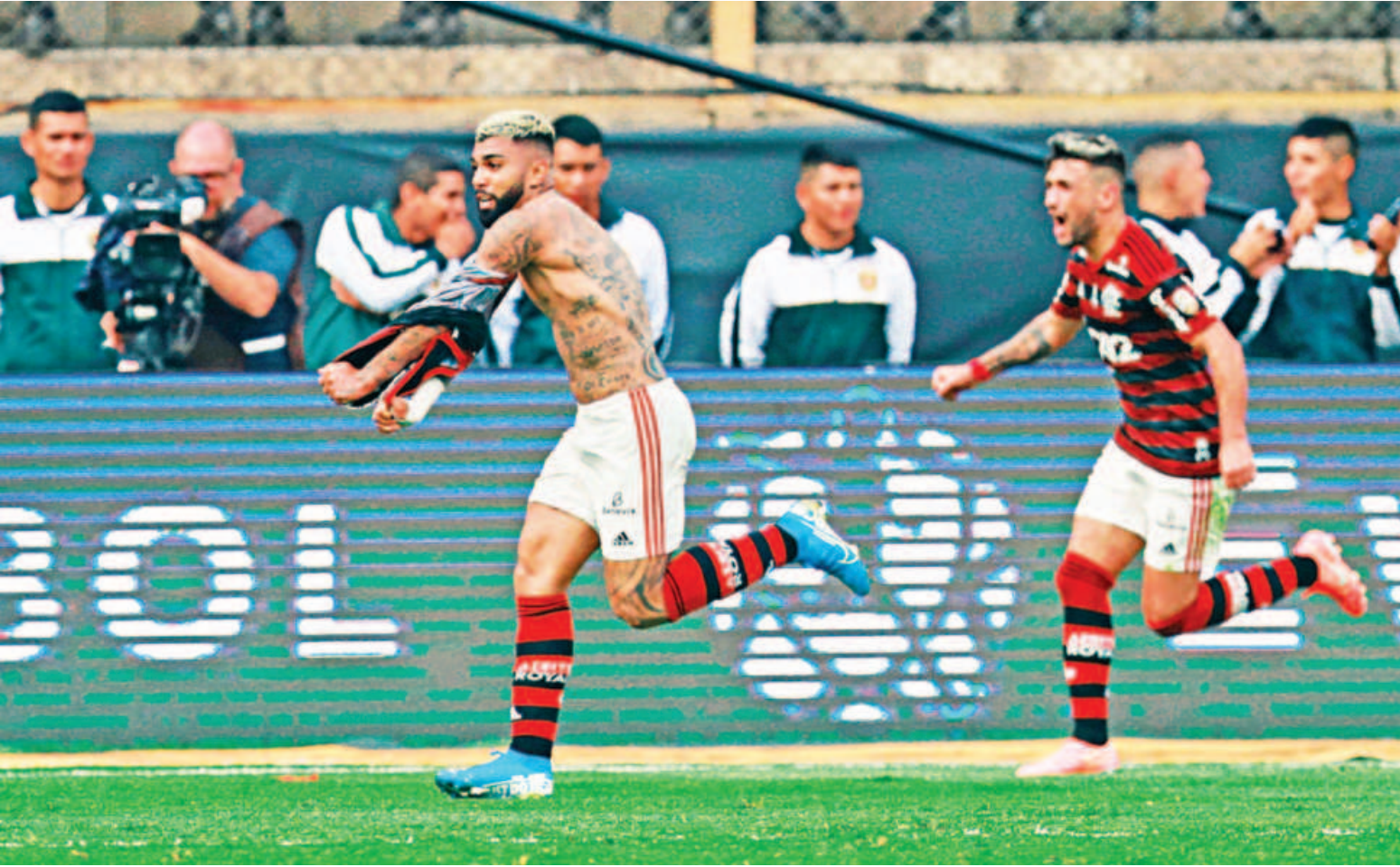
Flamengo's Gabriel Barbosa (L) peeled off his shirt while sprinting away in celebration after scoring the second goal in the Copa Libertadores final against River Plate in Lima, Peru on Saturday. His brace helped the side secure a 2-0 win and subsequently, the title.

Flamengo's fans delirious. Palacios, River's best player, was then sent off for kicking out at Henrique, quickly joined by Inter Milan loanee Barbosa, who had sarcastically applauded the referee. The striker left the field as the South American competition's top scorer, with nine goals. The Brazilian side improved after the interval but only really got going late in the second half, having shown nothing of the attacking verve and fluid passing instilled by new Portuguese coach Jorge Jesus that had swept them to the final and to the cusp of the Brazilian championship. Pressing high and aggressive in the tackle, River dominated the opening 45 minutes, time and again getting in behind Flamengo's 34-year-old full-backs Rafinha and Felipe Luis. Borré put River in front when he rifled in a shot on the turn from the middle of the penalty area after Flamengo failed to clear a cross. Before Barbosa's double, the closest Flamengo had come to an equalizer was in the 67th minute when Henrique cut back from the byline and Barbosa's shot was somehow blocked on the line by flying defenders, before being saved in the end by a grateful Armani.