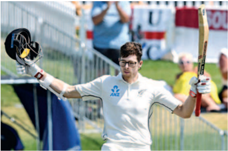
New Zealand's Mitchell Santner celebrates after scoring his maiden century on the fourth day of the first Test against England in Mount Maunganui yesterday.