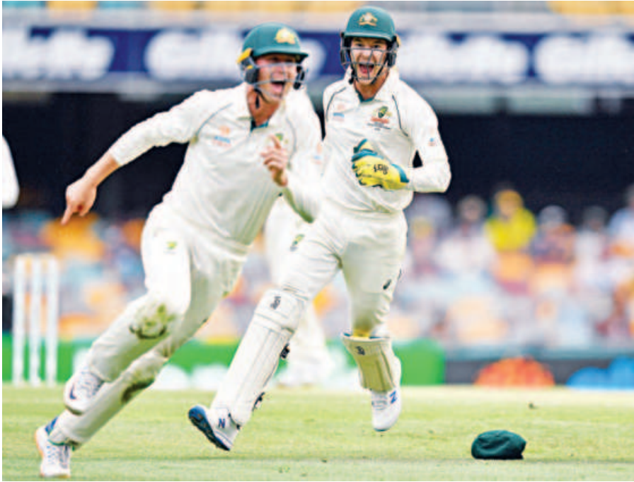
Australia's Marnus Labuschagne (L) scored 185 runs to set up an innings and five-run win over Pakistan on the fourth day of the first Test in Brisbane yesterday.