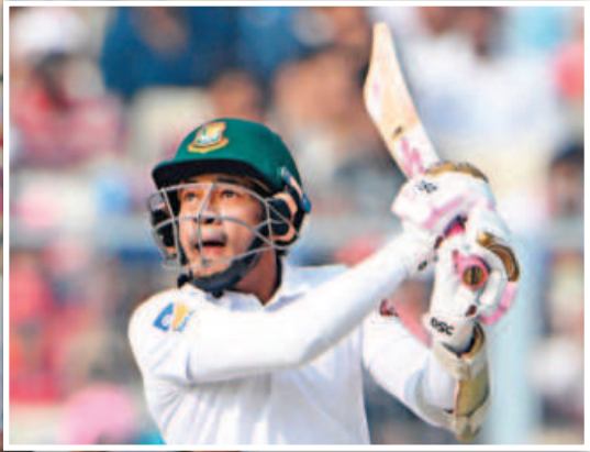
Triumphant India skipper Virat Kohli laps up the applause after India utterly outplayed Bangladesh, with brief resistance coming from Mushfiqur Rahim (inset), and sealed a 2-0 series win with an innings-and-46-run victory early on the third day of the second Test at the Eden Gardens in Kolkata yesterday.