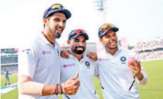
India pacers (from L-R) Ishant Sharma, Mohammad Shami and Umesh Yadav.