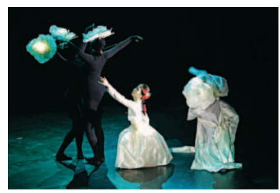
Korean troupe Seojung Dance Company perfors 'Spring, coming with warm breeze'