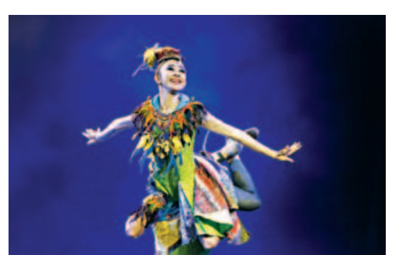
Lei Dance Theatre Taiwan perform 'Impression of our Home Town'