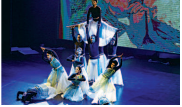
Artistes of Bangladesh Shilpakala Academy performing production 'From Ganges Delta to Bangladesh'