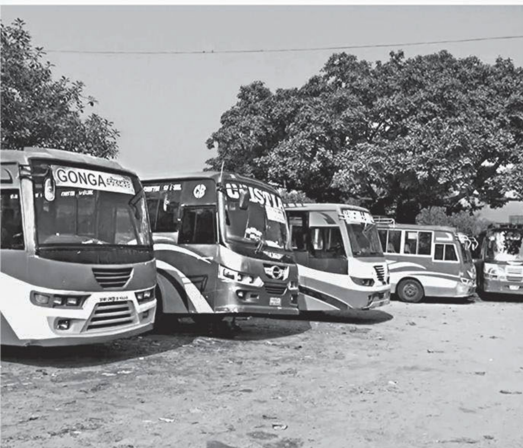
Buses lie idle at Dinajpur bus terminal yesterday, the fifth day of the strike enforced by bus owners and workers in the district. Right, three-wheelers remain the lone alternative for many commuters due to the situation.