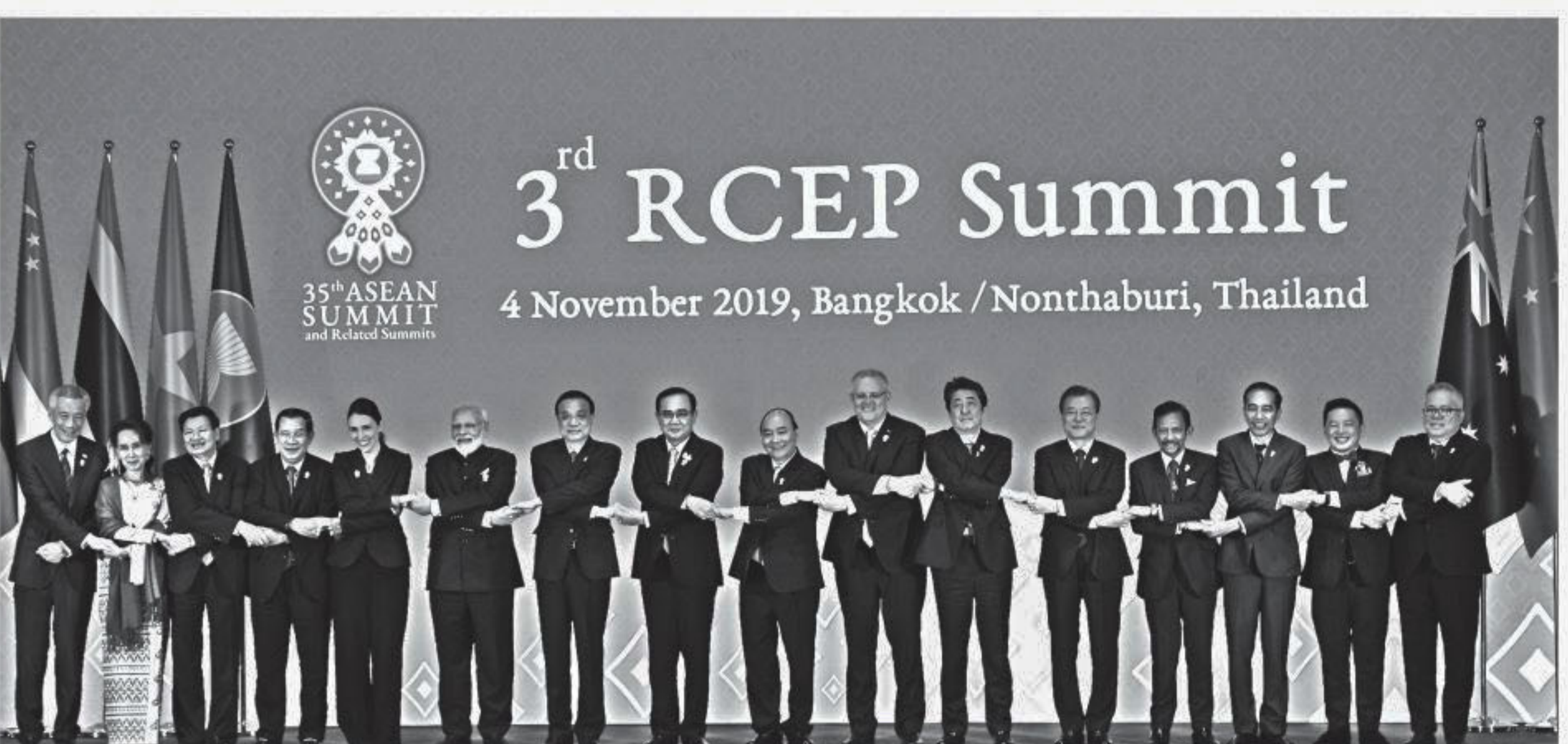
Asean leaders pose for a group photo during the 3rd Regional Comprehensive Economic Partnership (RCEP) Summit in Bangkok on November 4, 2019, on the sidelines of the 35th Association of Southeast Asian Nations Summit.

The government of India's action can be described as a protectionist move taken to save its domestic economy. This strong decision