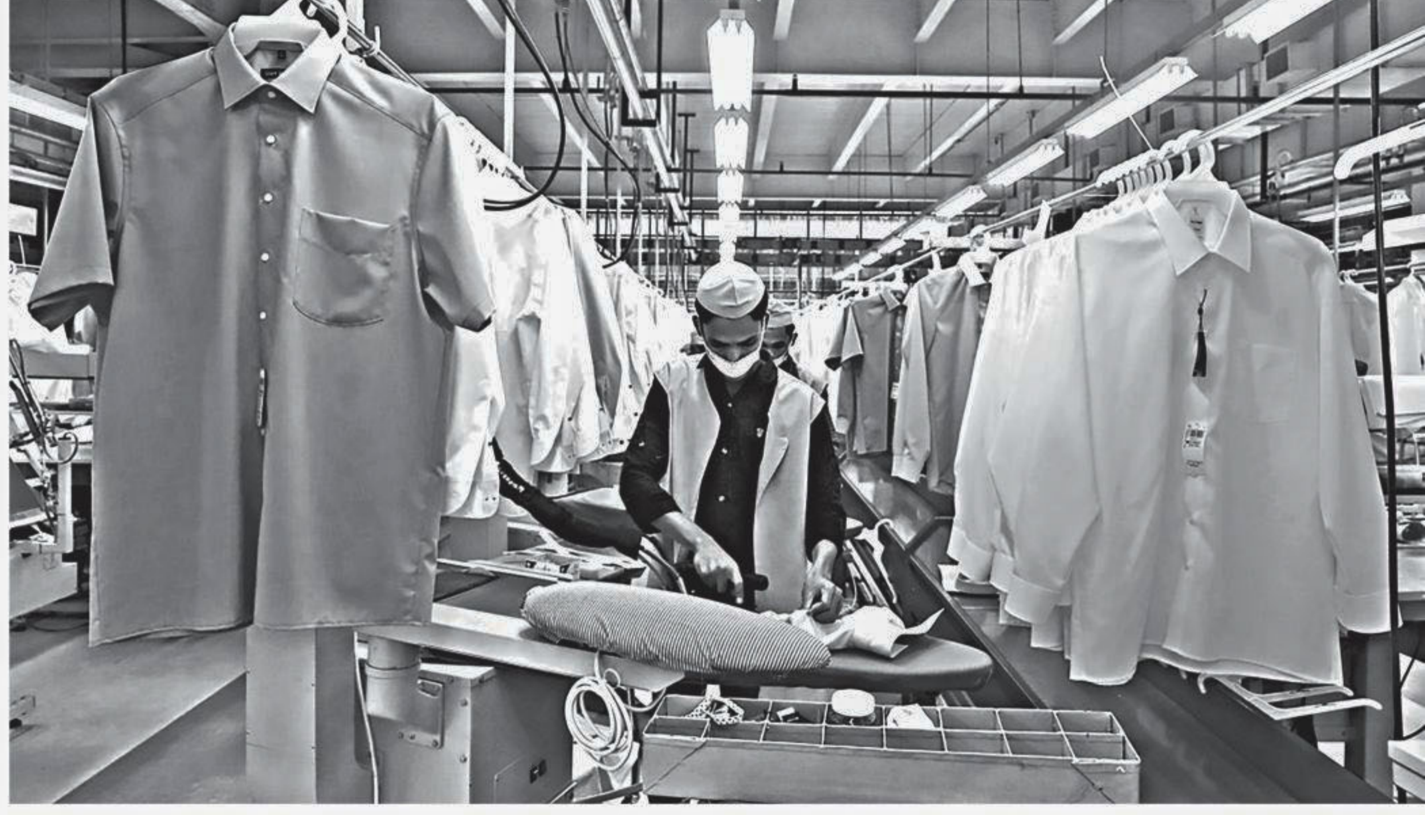
The industry is at a crossroads and has reached a stage of its development where fresh thinking and ideas are required if export growth is to get back on track.

In the Bangladesh RMG sector, where the global spotlight always shines so