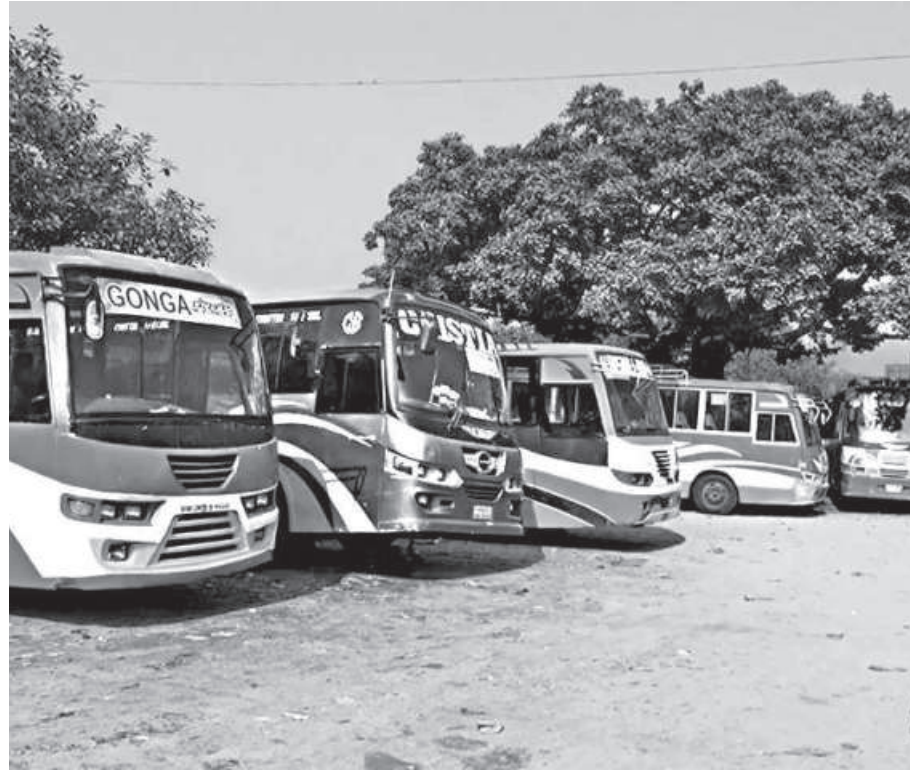
Buses lie idle at Dinajpur bus terminal yesterday, the fifth day of the strike enforced by bus owners and workers in the district. Right, three-wheelers remain the lone alternative for many commuters due to the situation.