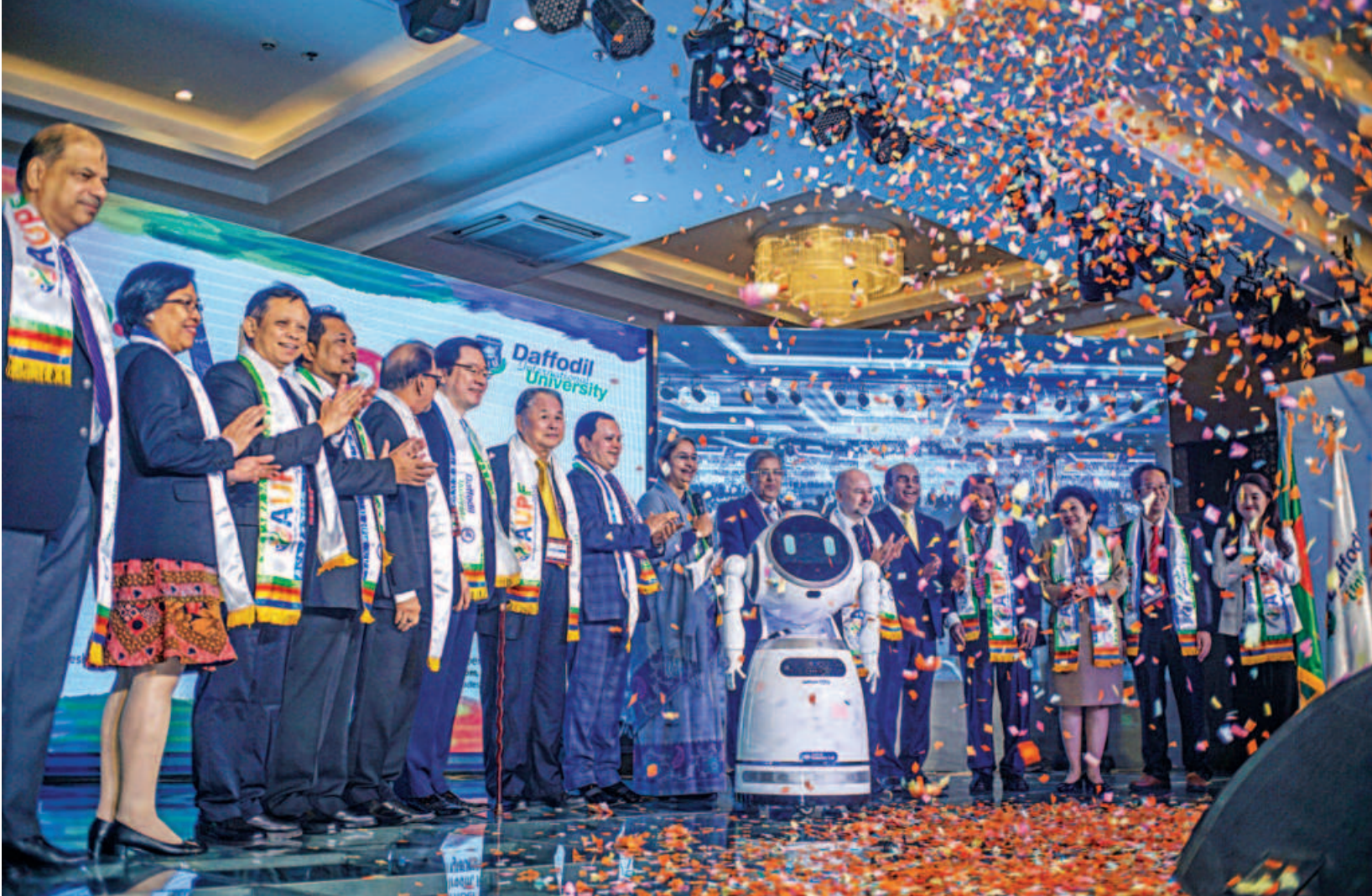
Education Minister Dipu Moni and other dignitaries at the inauguration of the 18th Asian University Presidents Forum 2019 at a hotel in the capital yesterday.