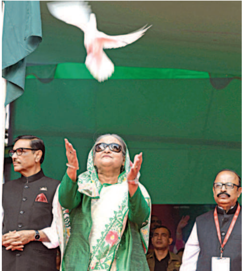
Prime Minister Sheikh Hasina releasing a pigeon during the inauguration of the 7th triennial congress of Jubo League at the capital's Suhrawardy Udyan yesterday.

“No one will remain unemployed in this country,” the PM asserted.