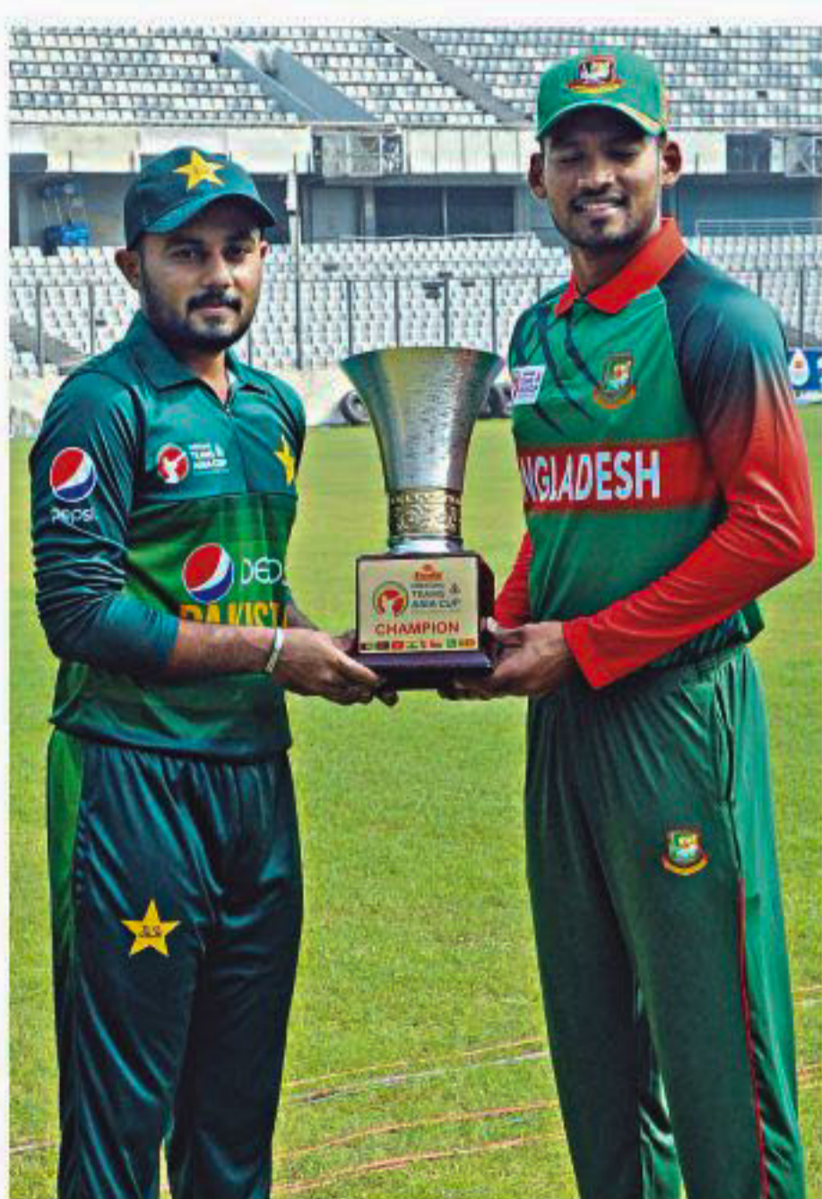
Bangladesh captain Najmul Hossain Shanto (R) and his Pakistani counterpart Rohail Nazir pose with the trophy ahead of today's ACC Emerging Teams Asia Cup final in Mirpur.