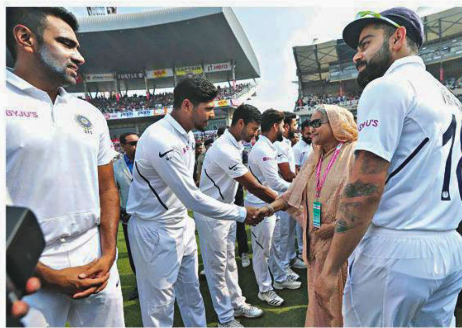
(Clockwise from L) India captain Virat Kohli introduced Prime Minister Sheikh Hasina to his team before the second Test against the Tigers began in Kolkata yesterday. Around 60,000 fans were in competitive mood as they watched the first day-night Test in the subcontinent unfold.

30.3 overs by then. India would then accumulate 176 runs for the loss of three wickets by the end of the third session. At the end of the day's play, a cultural show orchestrated to the musical performance of Runa Laila was performed. There were felicitations from Prime Minister Hasina and the Chief Minister for players of both sides and also for the former players of Bangladesh and India that participated in Bangladesh's inaugural Test in 2000. BCCI president Ganguly, BCB president Nazmul Hasan, former India skipper Sachin Tendulkar, chief minister Mamata and Prime Minister Hasina then delivered speeches in the felicitation programme. While the atmosphere was a vibrant one for the spectators, the Bangladesh team were bundled out for just 106 runs with the Indian pace battery running rampant. It was a brilliant atmosphere for fans with the pink ball fest a lively one but there was not much to rejoice in for the Tigers on a day that belonged to India.