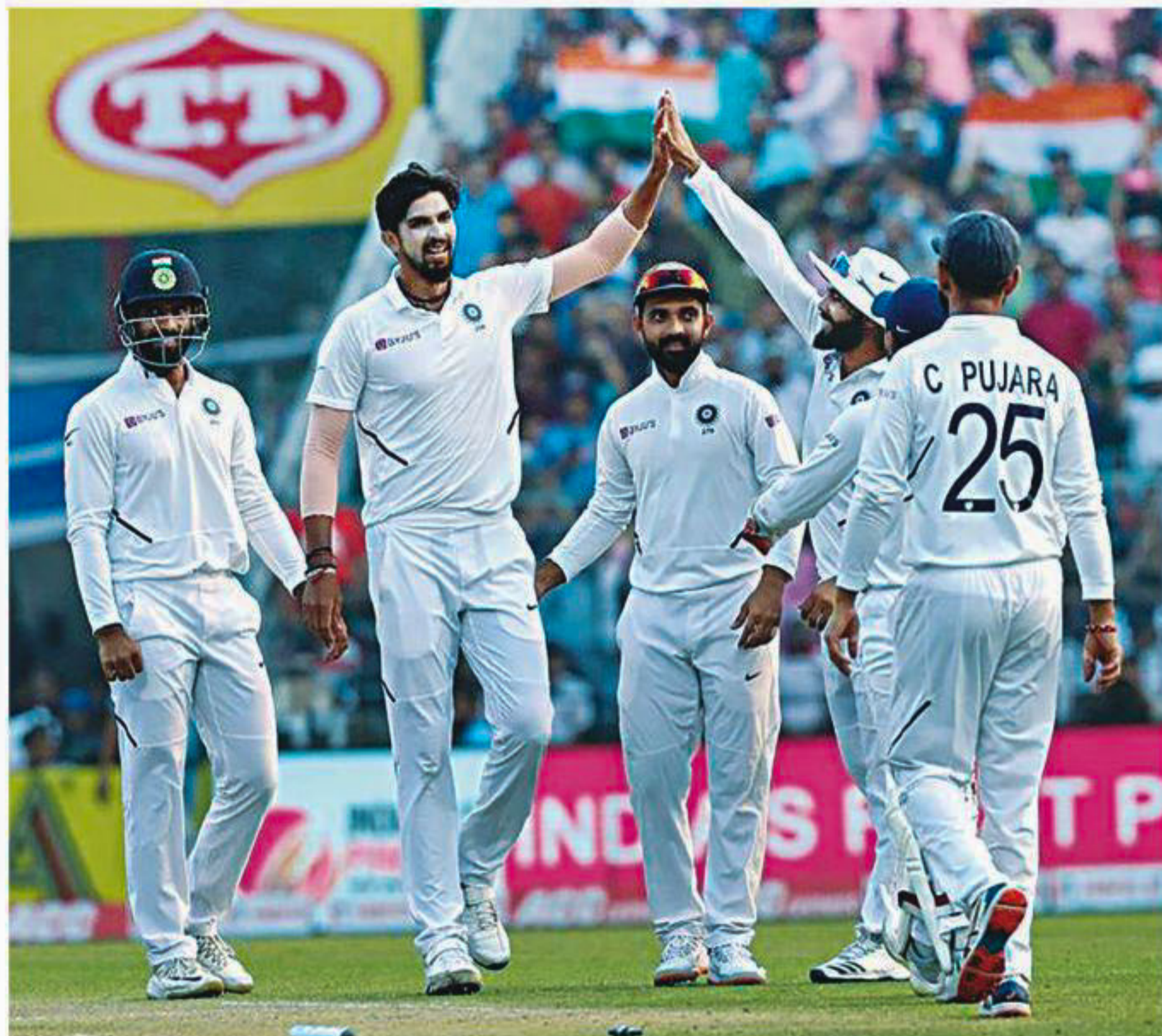
Bangladesh batsman Mohammad Mithun's (L) dismissal, bowled because he was too late in his defence, exemplified how unprepared the Tigers were to face the challenge of playing India's fast bowlers. (Inset) India's Ishant Sharma was the most successful of the fast men, his five for 22 helping to skittle Bangladesh out for a paltry 106 on the first day of the second Test at Eden Gardens in Kolkata yesterday.