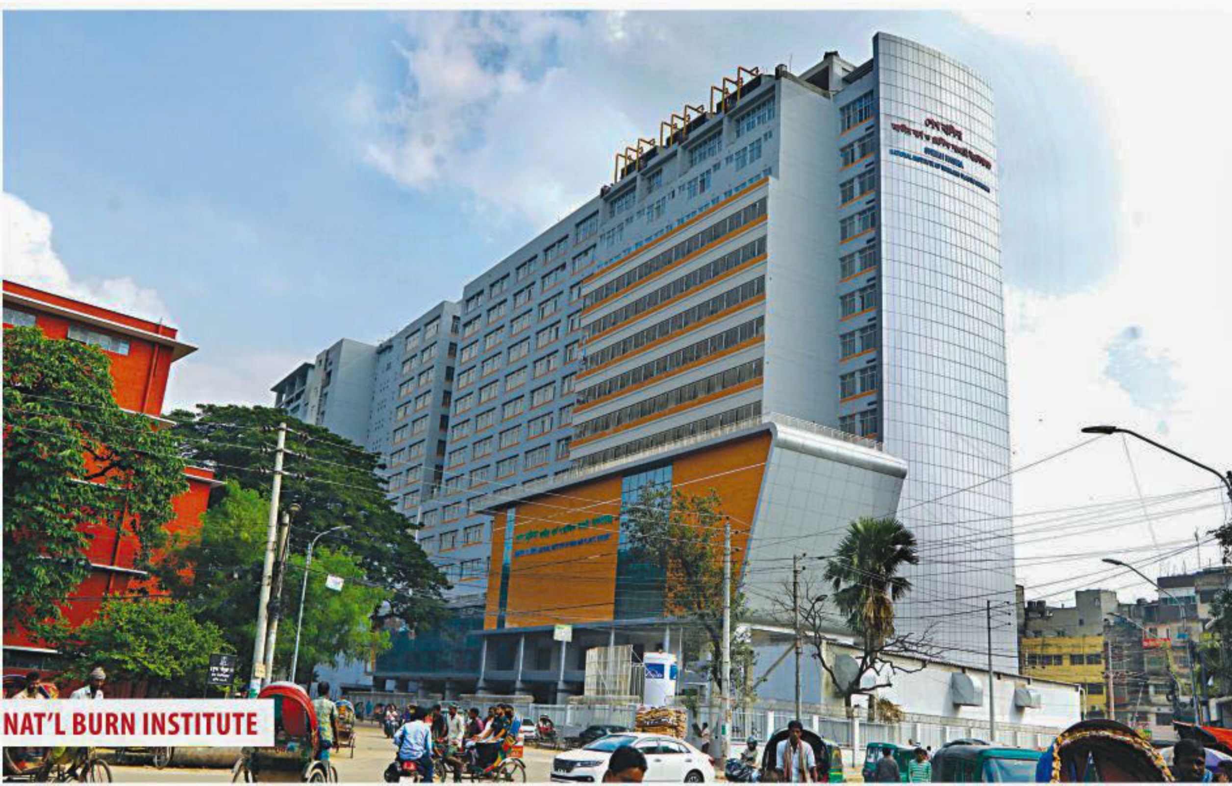
NAT'L BURN INSTITUTE