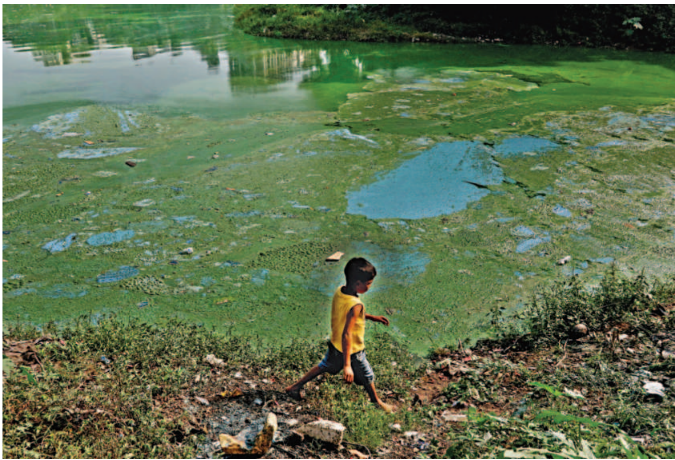
A child walks along Hatirheel near Tongi Diversion Road in the capital. Once a clear water body, the lake is now in an appalling state due to poor maintenance. Its water is so stinky that visitors find it difficult to go for a walk around the lake. The photo was taken on Thursday.