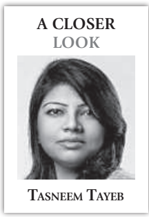
A CLOSER LOOK

Restriction on the use of international credit cards for online payment from Bangladesh