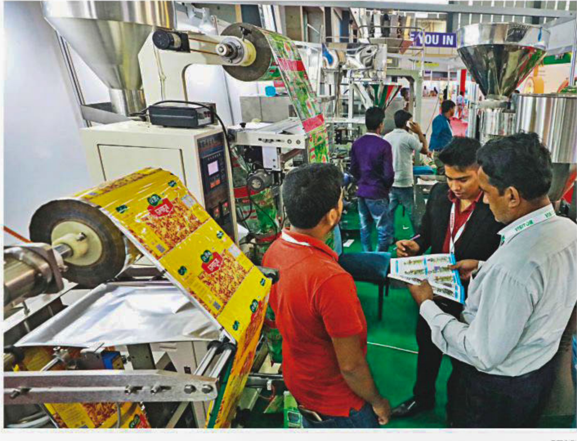
A stall attendee takes a visitor through a brochure at the "7th Bapa FoodPro International Expo 2019" at International Convention City Bashundhara yesterday.