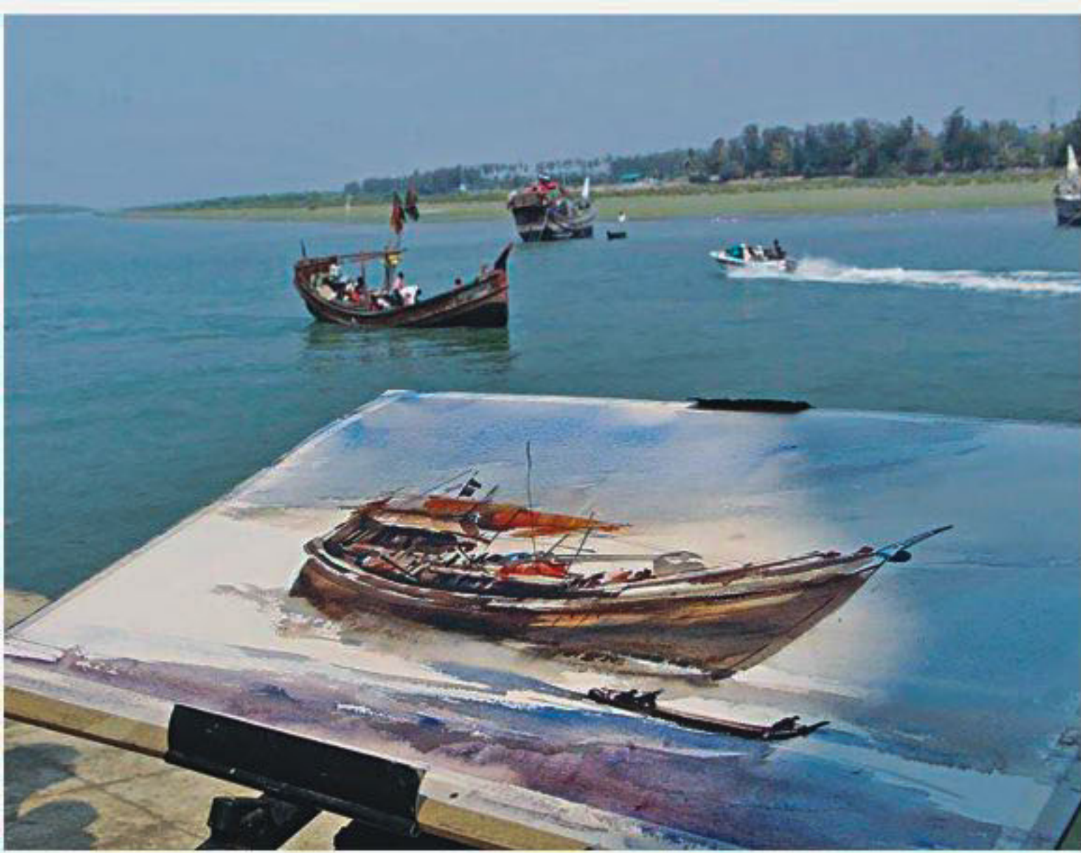
Artworks on exhibit at the event.