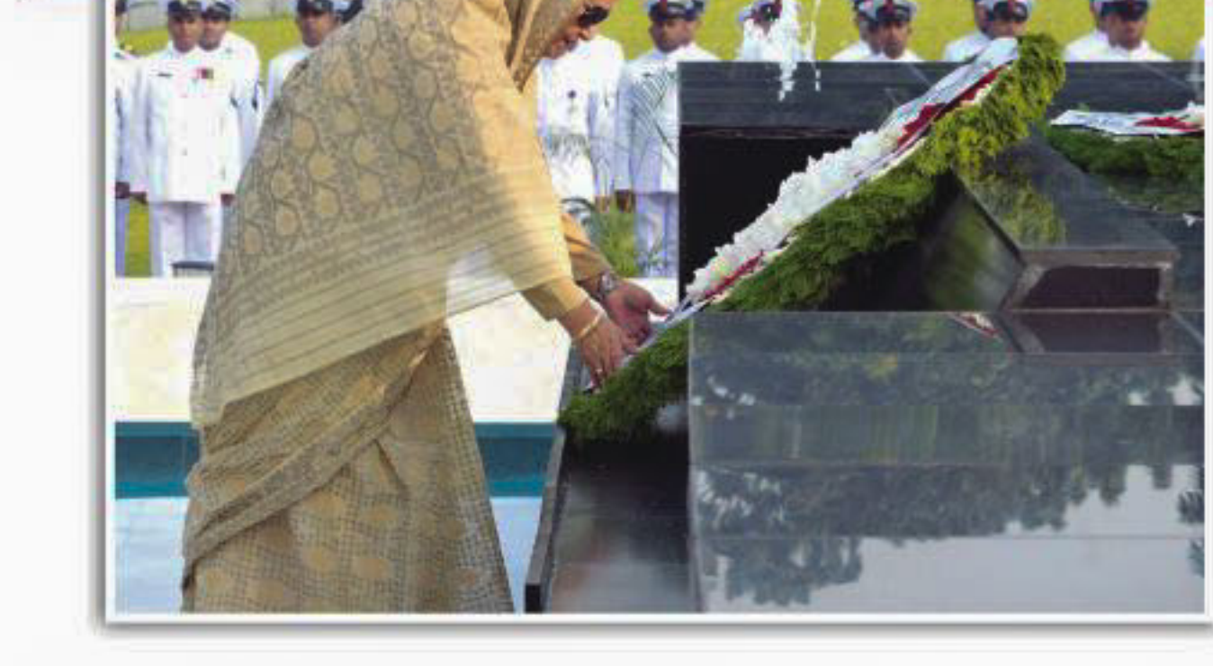
Prime Minister Sheikh Hasina greets guests at a reception organised at Senakunja in Dhaka Cantonment yesterday to mark the Armed Forces Day. Chiefs of the three services are also seen in the photo. Inset, the PM places a wreath at the Shikha Anirban to pay tribute to the martyred members of the armed forces.