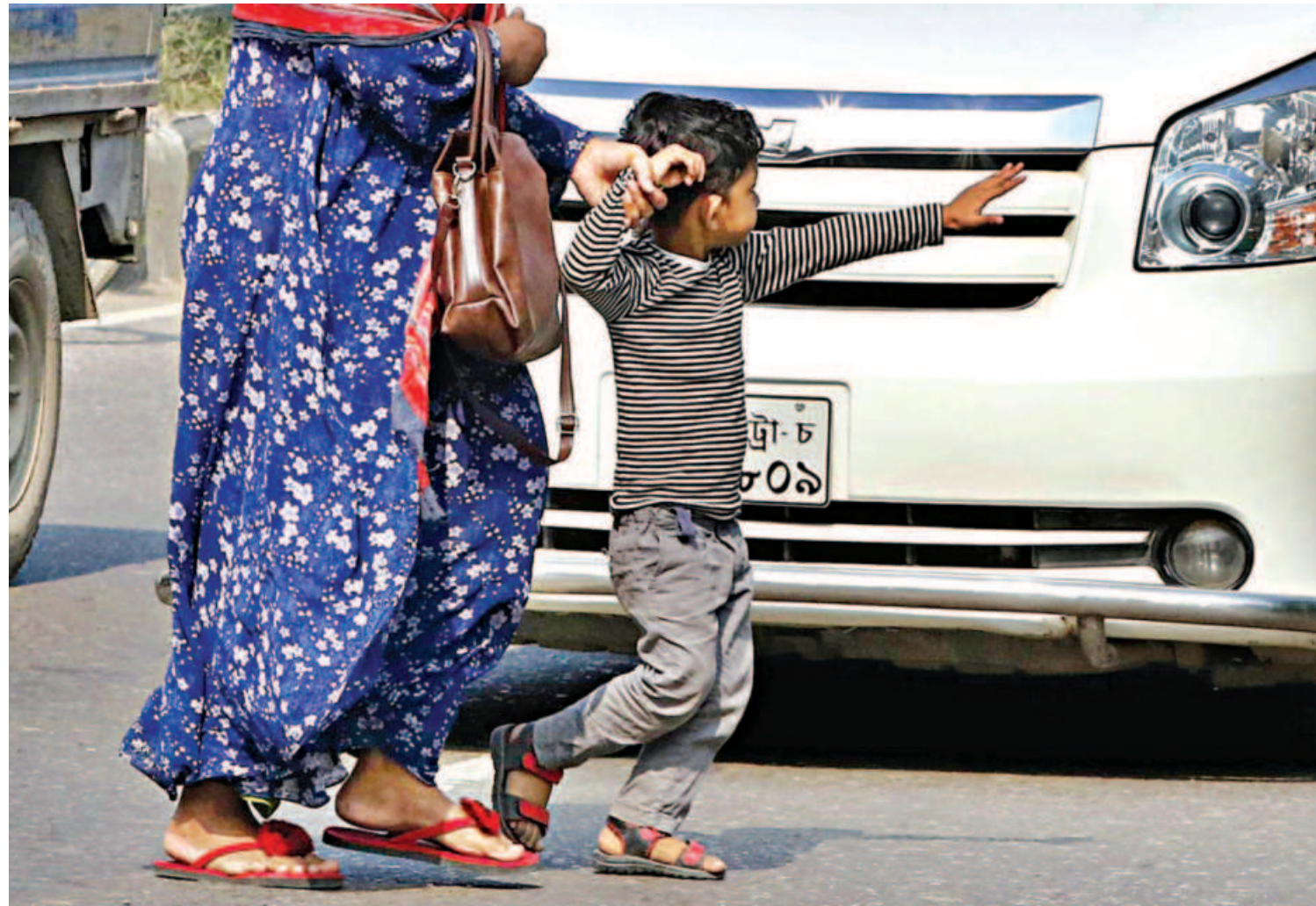
A child, whose hand is held by a woman, signals a vehicle to stop as they jaywalk in the capital's Rampura yesterday. There is a footbridge nearby. Every day, hundreds of people cross streets in the city this way, putting their lives at risk.