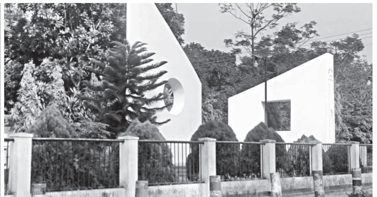
On November 22, 1971, Pakistani army in cooperation with their collaborators killed 43 people in Manikganj's Ghior upazila. This monument was built at Ghior upazila headquarters in memory of the martyrs.