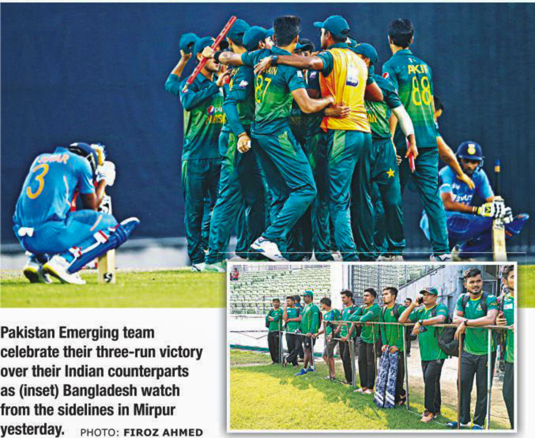
Pakistan Emerging team celebrate their three-run victory over their Indian counterparts as (inset) Bangladesh watch from the sidelines in Mirpur yesterday.