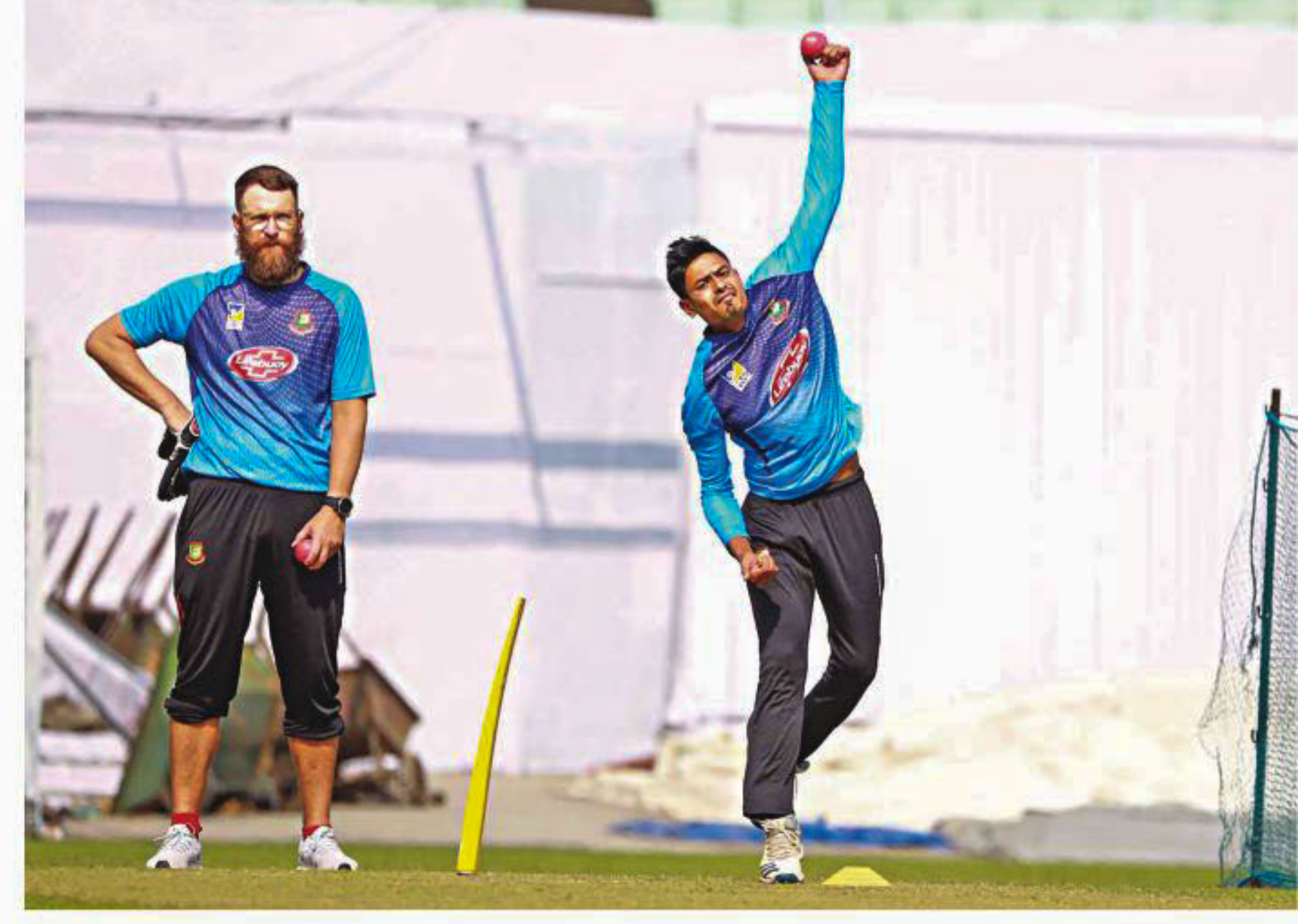
Bangladesh spin consultant Daniel Vettori was of the opinion that even though the pink ball is said to aid the pacers more, spinners like Taijul Islam and others will still have a role to play in the Kolkata Test.

commemorate the occasion. Bangladesh's contingent of players who played in Bangladesh's debut Test have all been invited for the occasion. The likes of Naimur Rahman, Akram Khan, Khaled Mashud and Hasibul Hossain are set to be present alongside India stalwarts such as Sachin Tendulkar and Rahul Dravid. Musicians will also light up the occasion at cricket's answer to the Colosseum. "Star [Sports] will be doing a show with Sachin [Tendulkar], Kapil [Dev], [Sunil] Gavaskar and Rahul [Dravid]. At tea time, a cart will take former captains around the ground. There will also be a musical performance. There will be felicitations with both the team's former captains, [Bangladesh's] prime minister and [West Bengal's] chief minister. Runa Laila and Jeet Ganguly will be performing and Sourendro-Soumyojit too. So, a whole lot of functions," Ganguly said. The pink ball Test has gripped the locality as far as public response is concerned and Ganguly was ecstatic. "Just see the excitement. Four days are already sold out. When have you last seen a Test match where four days were sold out?" he questioned. "The tickets are gone."