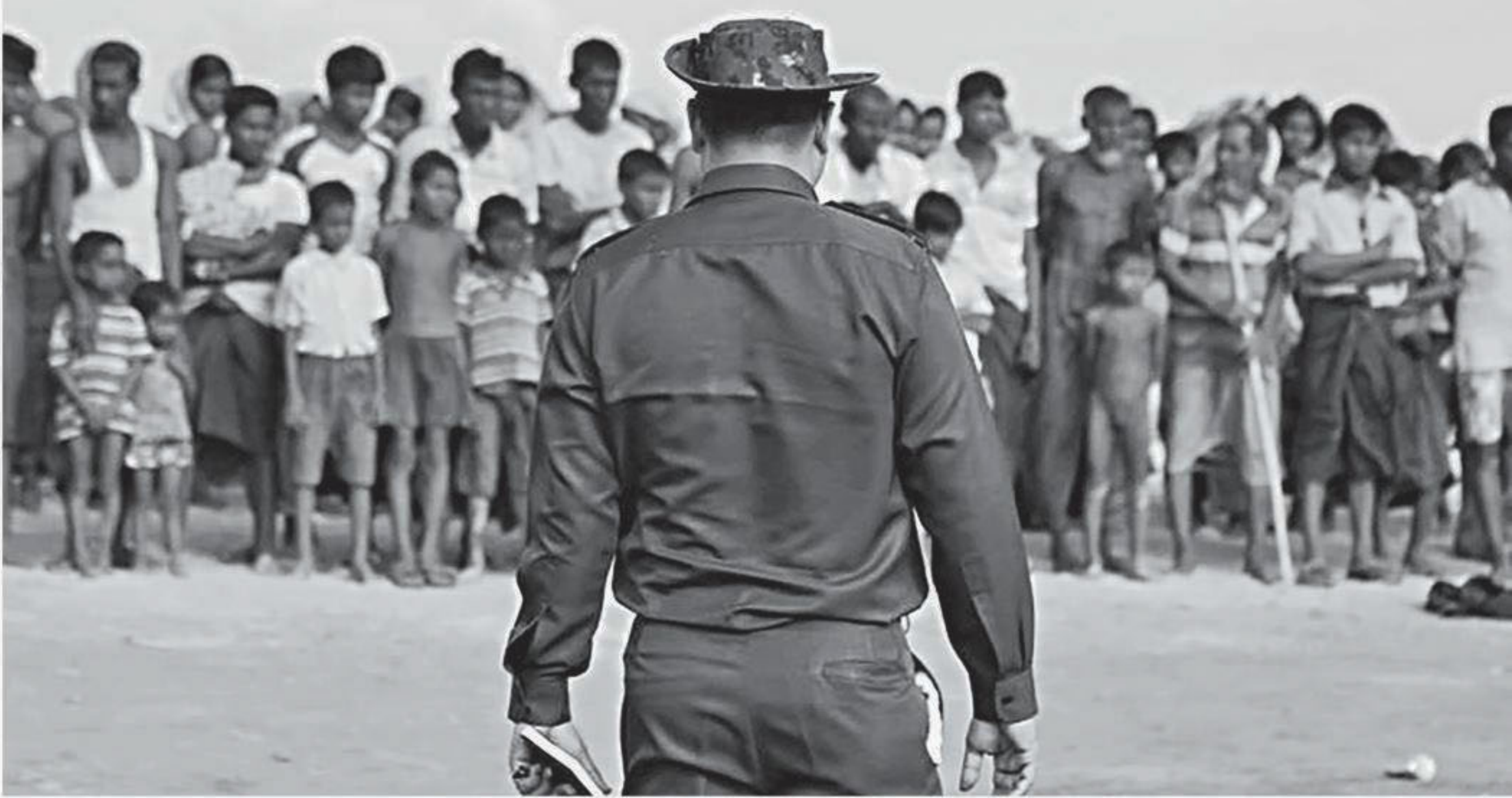
The crisis of the Rohingya is one of identity and existence.

has already rejected the ICC investigation. Myanmar's close allies—China, Russia and India—had in the past either vetoed UN resolution or refrained from voting against Myanmar. The UN Special Envoy Yanghee Lee recently said that Myanmar should face prosecution at the ICC and that conditions on the ground remain too dangerous for those in Rakhine state and the million Rohingya refugees in Bangladesh. What is then the importance of Gambia invoking genocide convention against Myanmar? First, the move by Gambia marks a significant development in the Rohingya's struggle for justice. Second, it will help advance accountability for the genocide triggering the establishment of the largest refugee camp in Bangladesh. Third, as pointed out by Bob Rae, the Canadian Special Envoy to Myanmar, it will end impunity for those accused of committing the