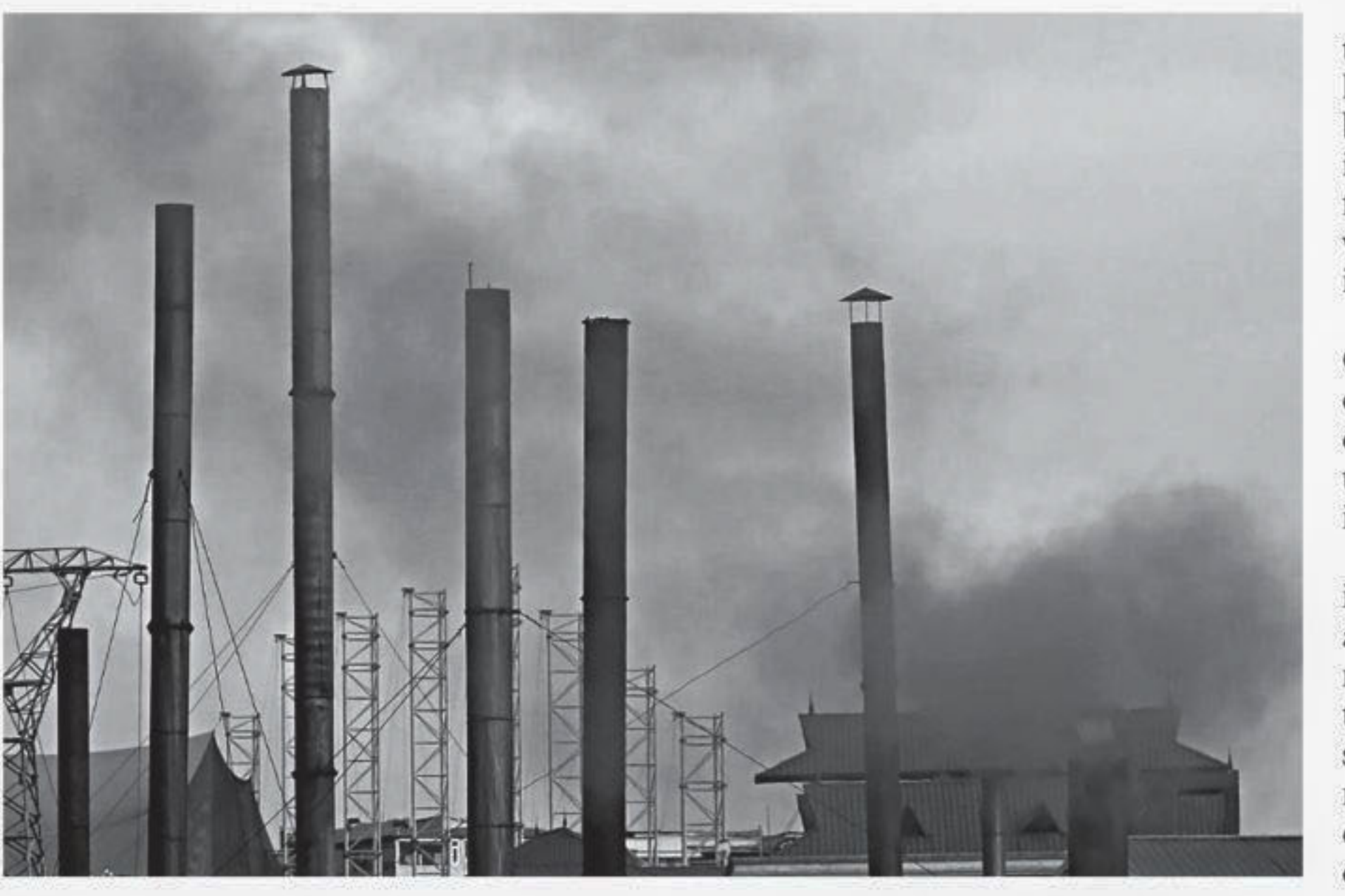
Smoke rises from the chimney of a paper factory outside Hanoi, Vietnam May 21, 2018.

once the damage is done it will be too late to rectify the situation. Another area to take into account is the planned development of the eastern side of Dhaka city which is currently a major wetland area. If this development does not take a genuine nature-based development approach we will simply repeat the problems of waterlogging that we have to endure in the western part of Dhaka, which has been built by destroying the many wetlands that used to exist.