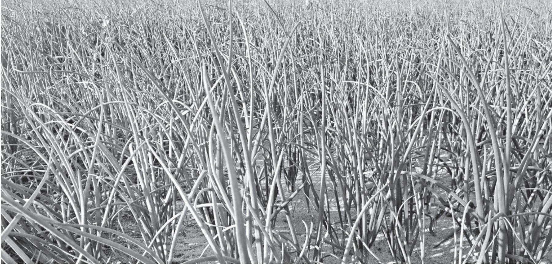
An onion field at Char Sindurna in Hatibandha upazila of Lalmonirhat. Below , freshly harvested leafy onion kept for sale at Haripur Char in Sundarganj upazila of Gaibandha.

After examining witnesses and evidences, the judge found the two guilty and pronounced the verdict.