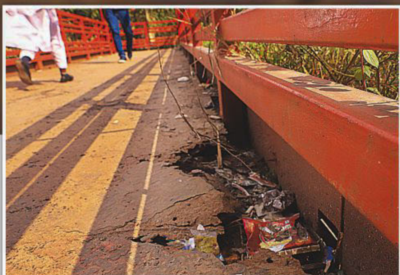
A gaping hole in a footbridge near the capital's Azimpur Government Girls School and College. Locals said the footbridge remained in a sorry state for the last several months. The authorities have apparently done nothing to repair the bridge. The photo was taken recently.