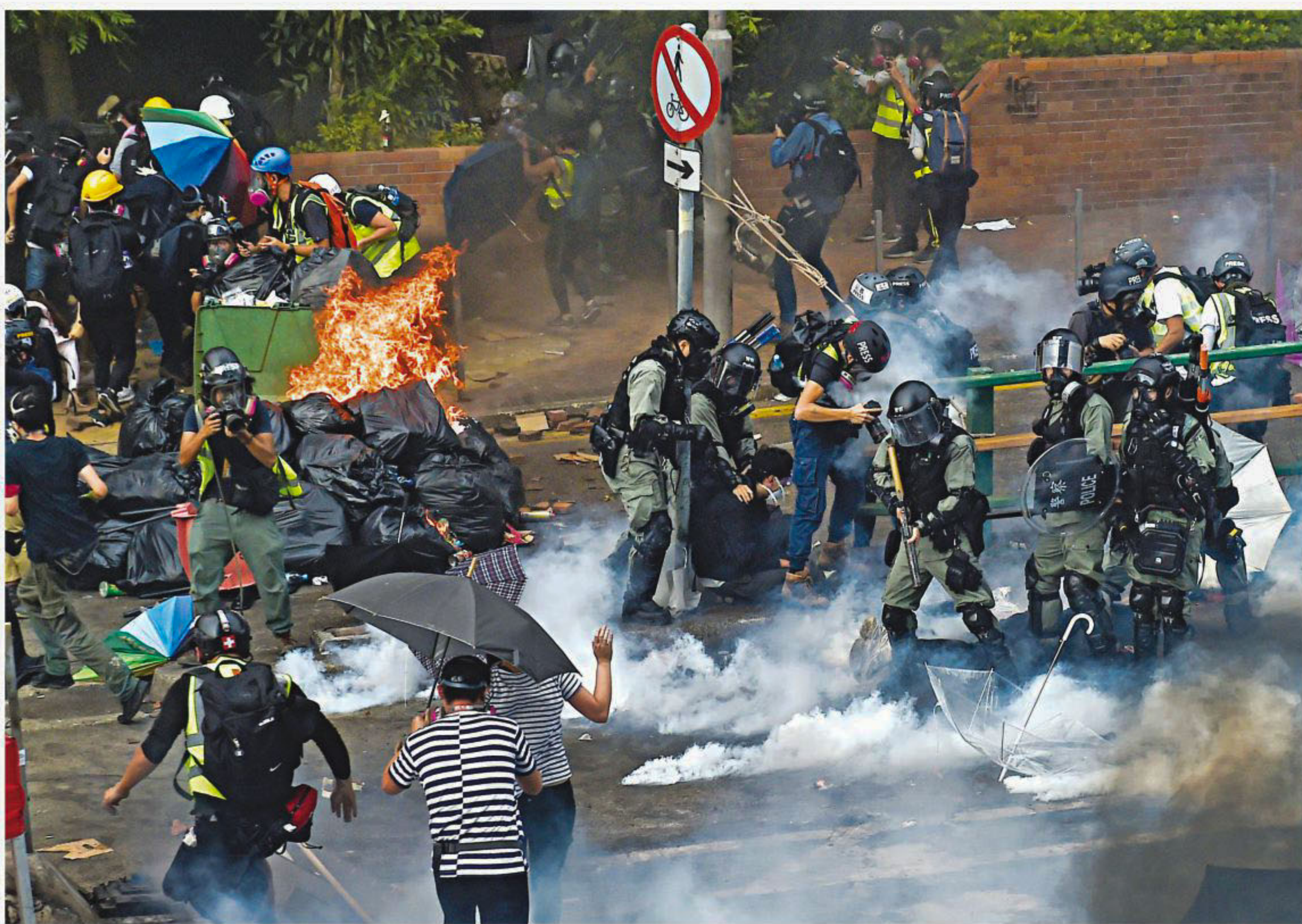
Riot police (R) make arrests as protesters (L) attempt to find safe passage out of the Hong Kong Polytechnic University campus in Hung Hom district of Hong Kong yesterday.