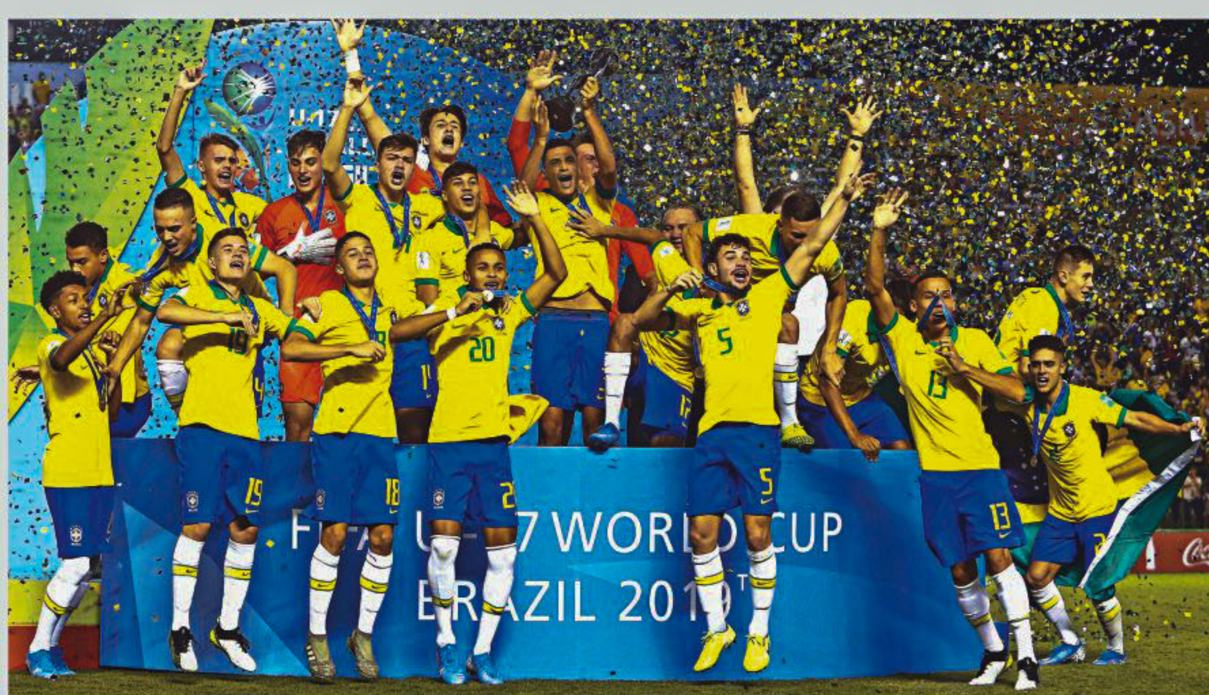
Brazil players celebrate with their medals after winning the FIFA U-17 Men's World Cup final against Mexico at the Bezerro Stadium in Brasilia on Sunday.

Barishal, in reply, lost three quick wickets and ended the day on 30 for three, trailing by 22 runs.