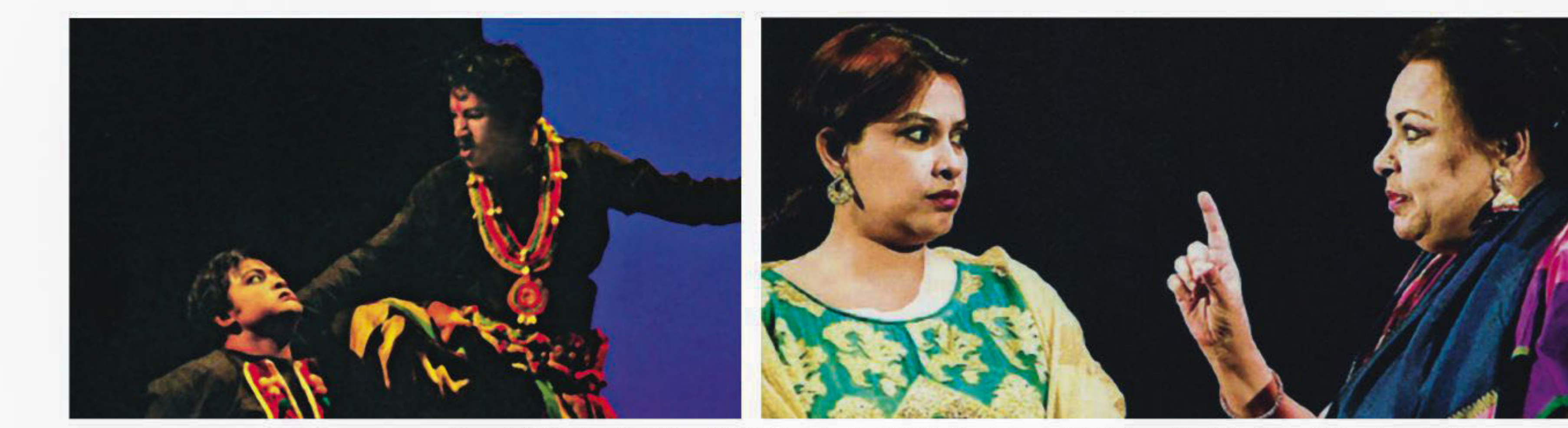
IDLC THEATRE FEST 2019 (From left) On the first day of IDLC Theatre Fest 2019, 'Rosh Puran' by University of Dhaka, will be staged at the Experimental Hall, Bangladesh Shilpakala Academy (BSA) at 6:30 pm. On the other hand, the popular play 'Bhoddornok' by Nattyachakro will be staged at the National Theatre Hall, BSA, at 8:30 pm.