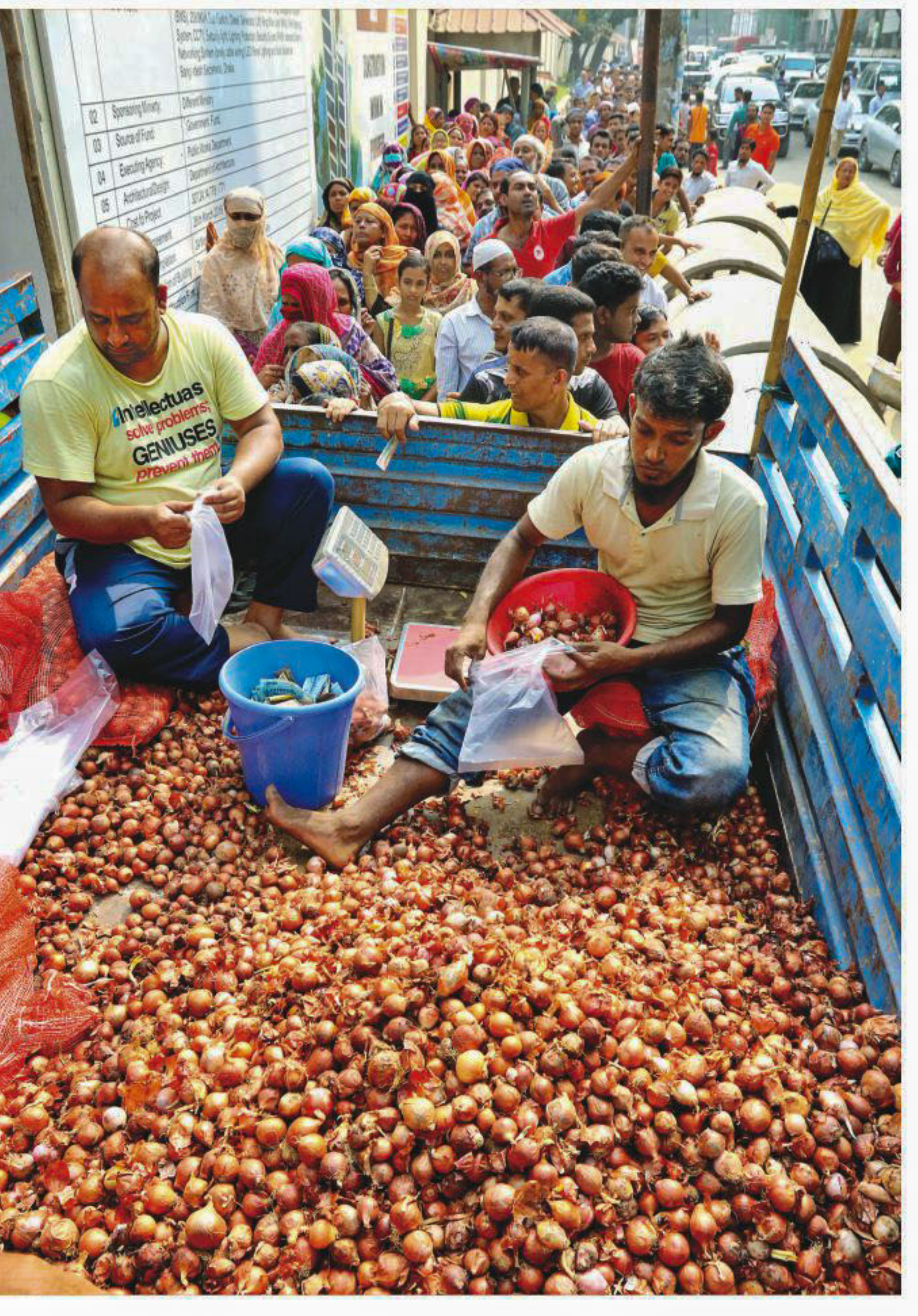
People queue to buy onions at Tk 50 a kg from a truck of the state-run Trading Corporation of Bangladesh in the capital's Secretariat area. The photo was taken yesterday.

STAR REPORT Transport workers in nine districts yesterday enforced a strike, defying Road Transport and Bridges Minister Obaidul Quader's call for them to refrain from such programmes centring the Road Transport Act-2018. The transport workers in Khulna, Satkhira, Jhenidah, Narail, Kushtia, Meherpur, Jashore, Rajshahi, and Bhupur upazila of Tangail went for the strike, demanding changes in several sections of the act. Although central leaders of transport owners and workers associations said they did not instruct their units to go for the strike, many workers observed work abstention. The RTA was finally effective Sunday more than 13 months after parliament passed it aiming to bring discipline in the SEE PAGE 2 COL 3