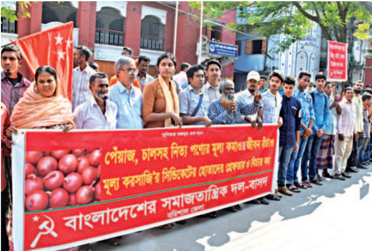
Bangladesh Samajtantrik Dal members protest the continuous price hike of onion and other daily essentials in front of the Ashwini Kumar Town Hall in Barishal city yesterday.