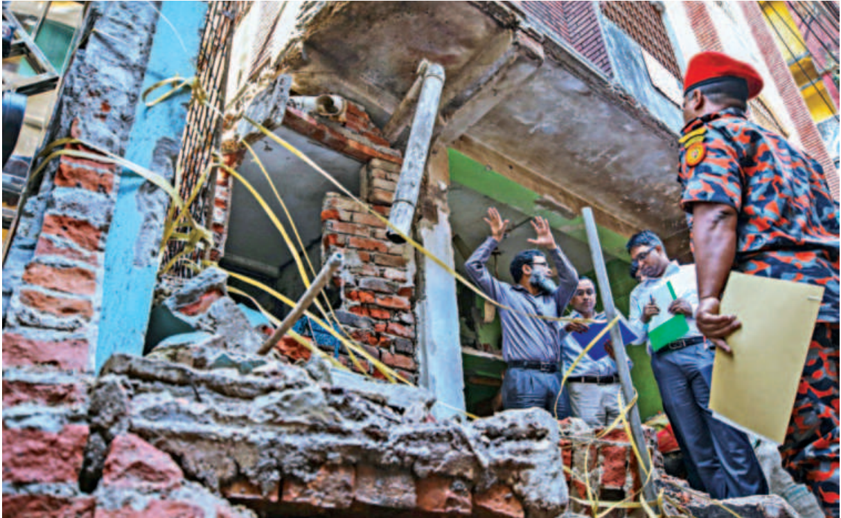
Members of the probe committee inspecting the blast scene yesterday morning.