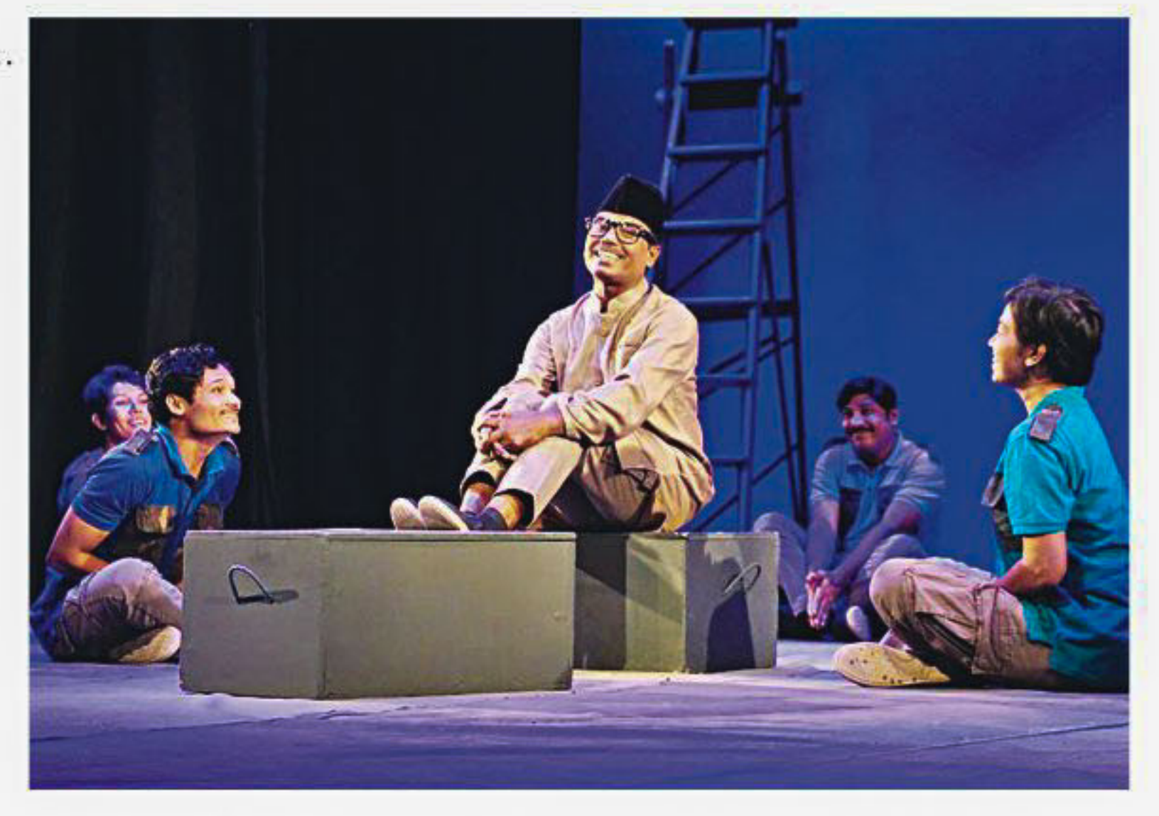
'Crutch-er Colonel' was staged on the opening day.

TIASHA IDRAK The eleven-day international theatre festival, BotTala Rangamela 2019 , began yesterday at the Liberation War Museum in Agargaon. With an objective of breaking the brutal silence of indifference and embrace the courage of magnanimity, the festival was inaugurated by renowned theatre personality Ataur Rahman.