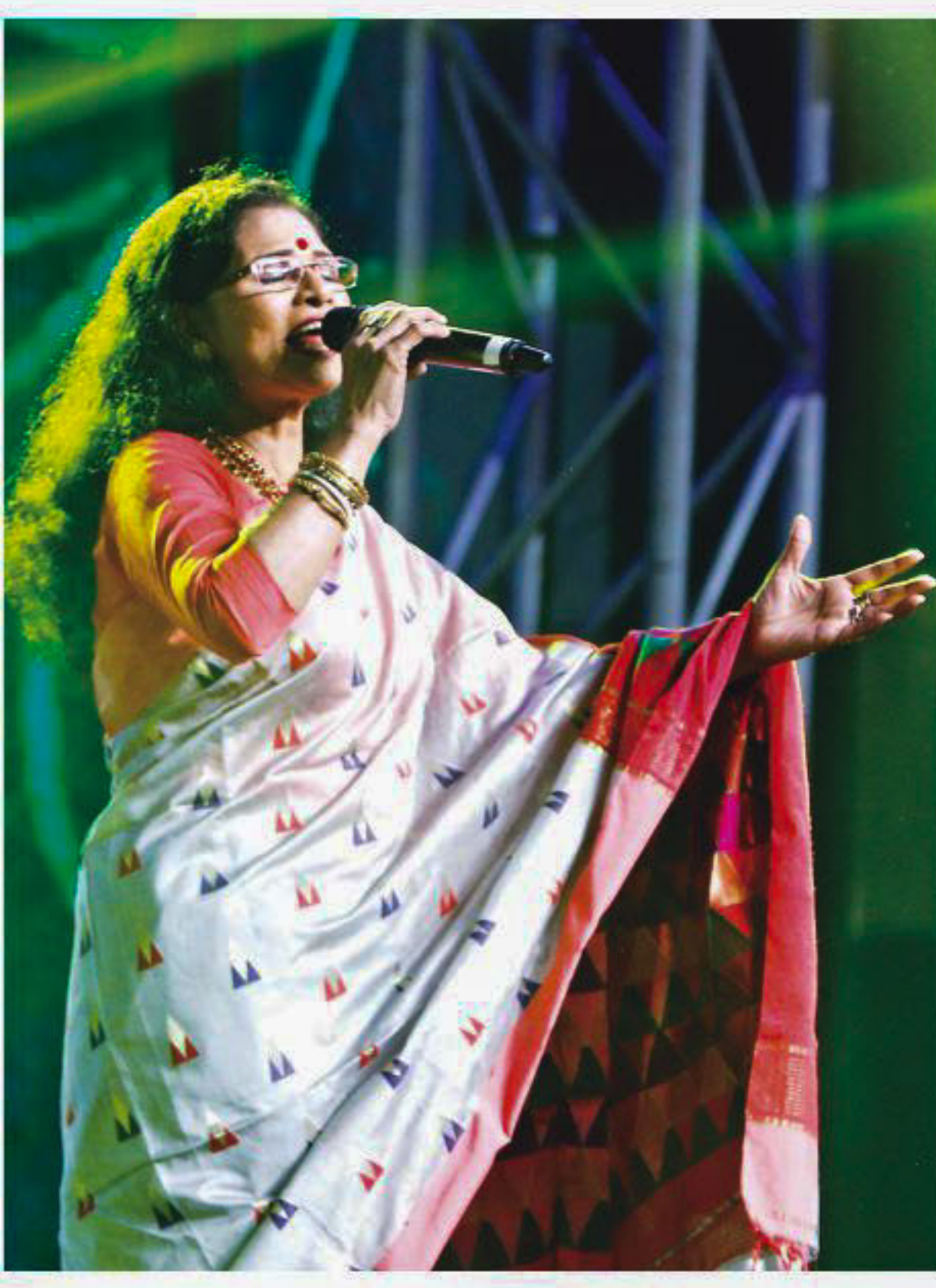
Eminent folk singer Chandana Majumder serenading the audience