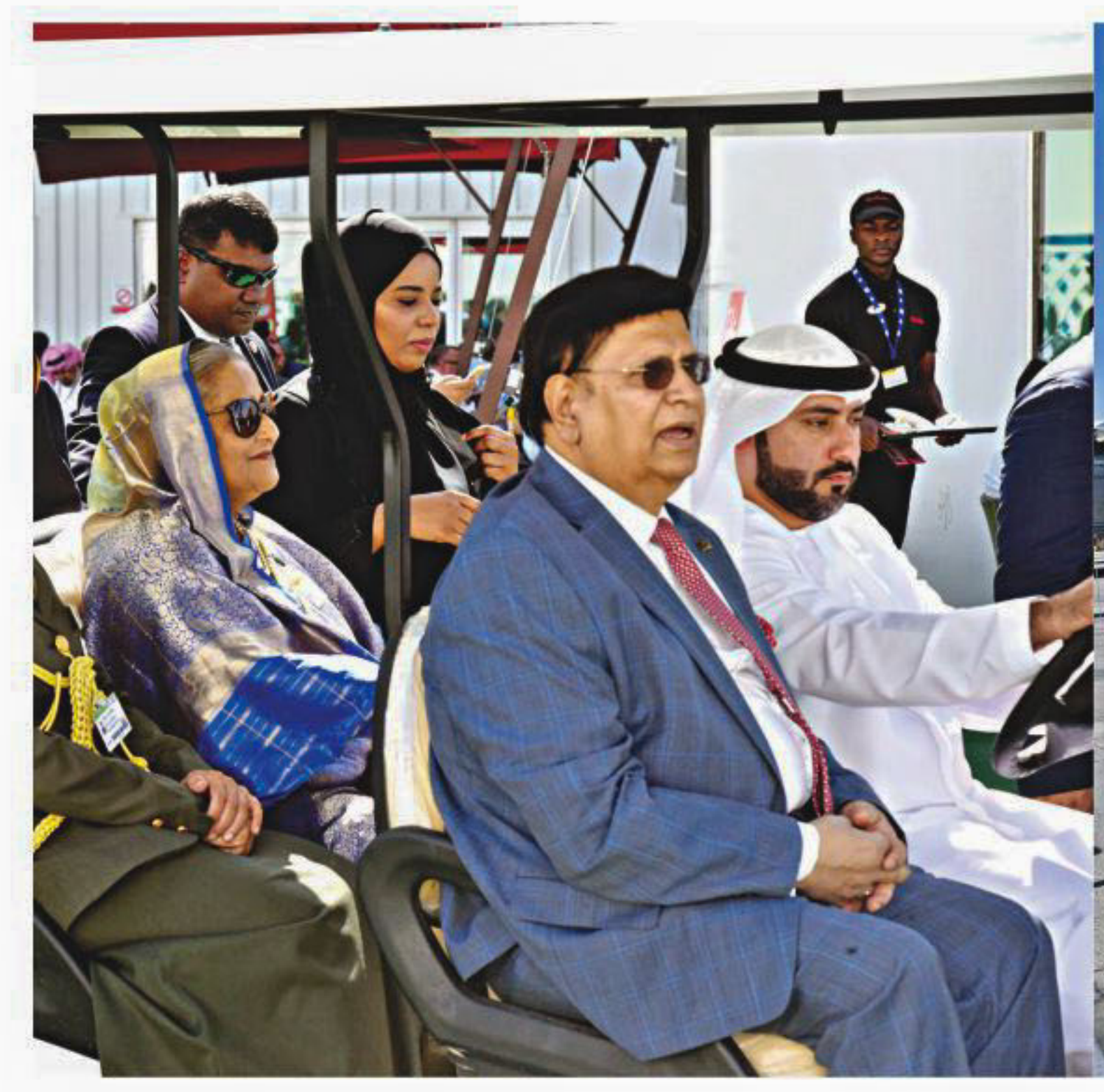
Prime Minister Sheikh Hasina at the Dubai Airshow in DWC Dubai Airport yesterday.