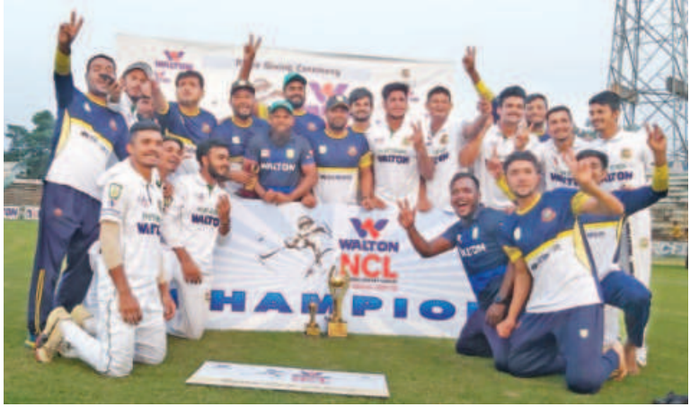
Players of Sylhet Division celebrate after beating Chattogram Division by nine wickets in the National Cricket League at the Shaheed Chandu Stadium in Bogura yesterday. Sylhet emerged champions of Tier 2.

Shukkur scored sixties and were among only three batsmen in the eleven that got into double figures in the face of some fiery bowling from Ruyel, who ended with the figures of five for 39 from 15.1 overs.