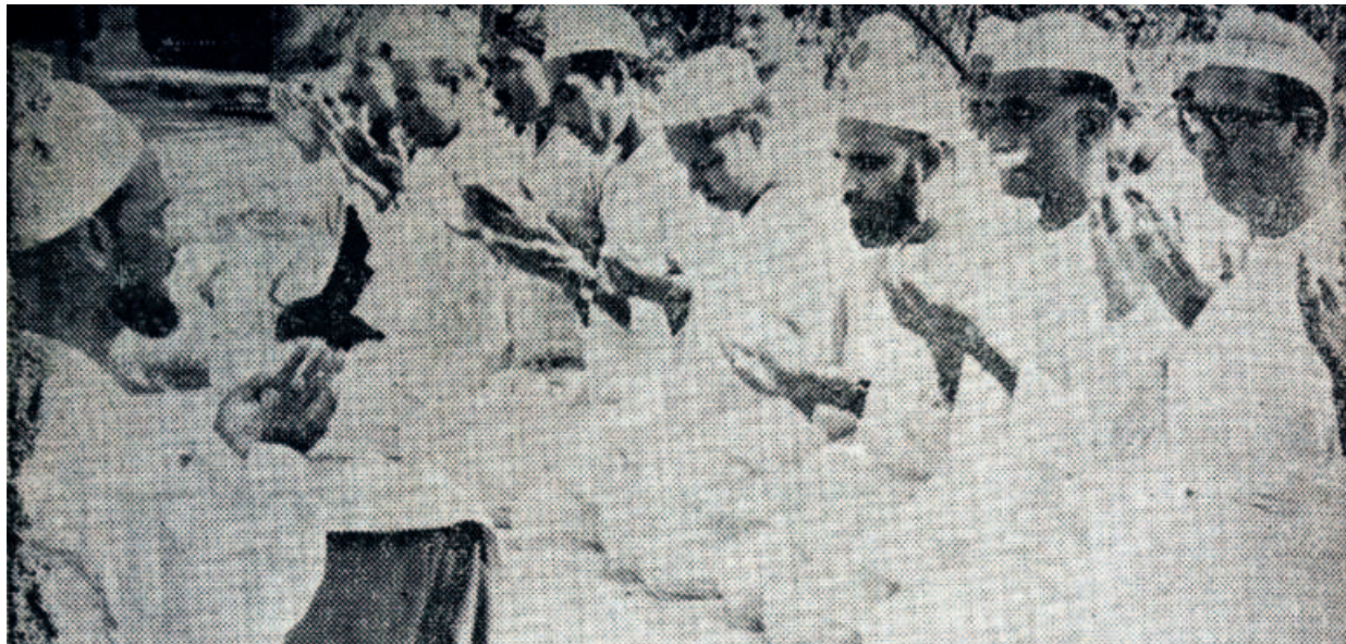
Tajuddin Ahmad, General M A G Osmani and other employees of the Mujibnagar headquarters join the Eid jamaat prayers.