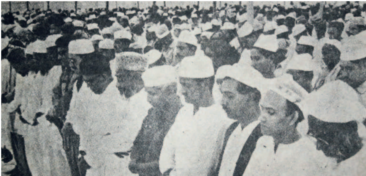
Eid prayers at the Outer Stadium in Dhaka.