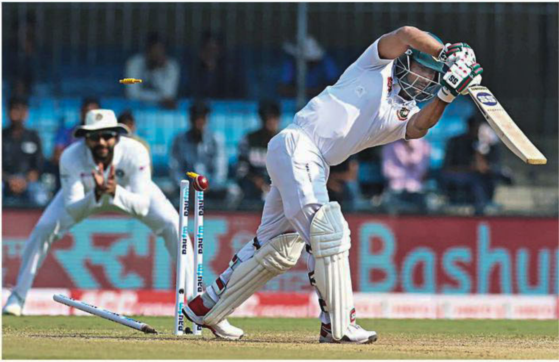
The dismantled stumps of Bangladesh opener Imrul Kayes (L) and India captain Virat Kohli's wild celebration probably best epitomise the Tigers' state of helplessness against a rampaging home side. The visitors went down by an innings and 130 runs on the third day of the first Test in Indore yesterday.