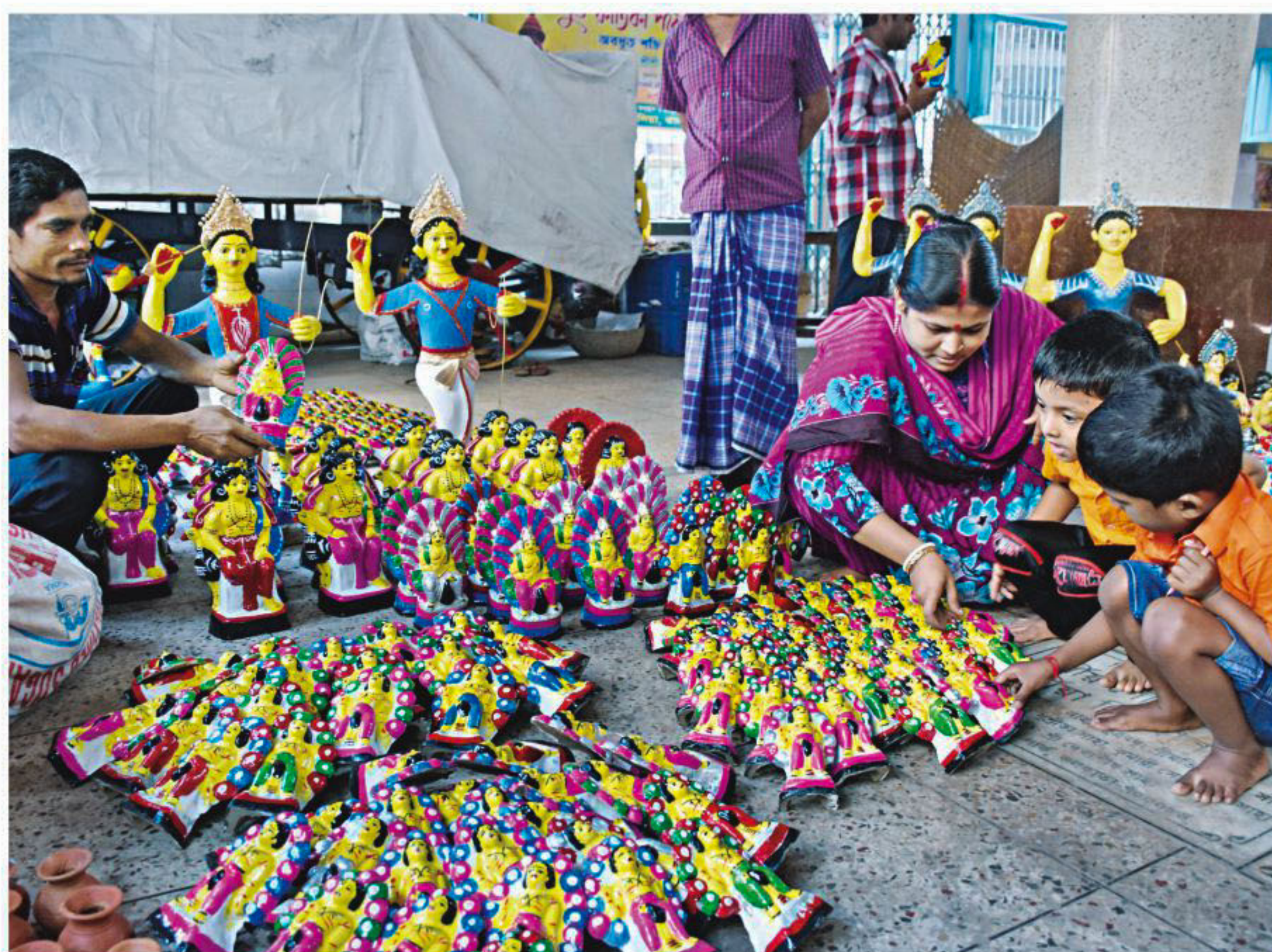
Two boys help their mother select an idol of Kartik at Sri Sri Hari Thakur temple in Barishal city yesterday. Hindus across the country will observe Kartik Puja today.