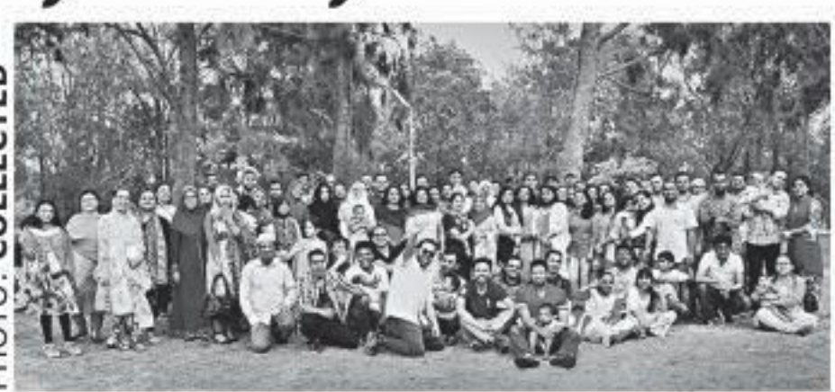
Cuet alumni in Australia organised a daylong community event in Sydney's Carss Bush Park on November 3.

"CUETians in Australia", an alumni association of Chittagong University of Engineering and Technology (Cuet), organised a daylong event in Sydney's Carss Bush Park on November 3, said a press release. The event was open for all former students of Cuet and their family members. More than 180 attendees, many from Melbourne, Canberra and other adjacent cities, took part in the programme. A host of recreational activities and outdoor games were arranged for attendees. Members collected funds for community development and engagement activities, and a scholarship programme was introduced for talented but financially