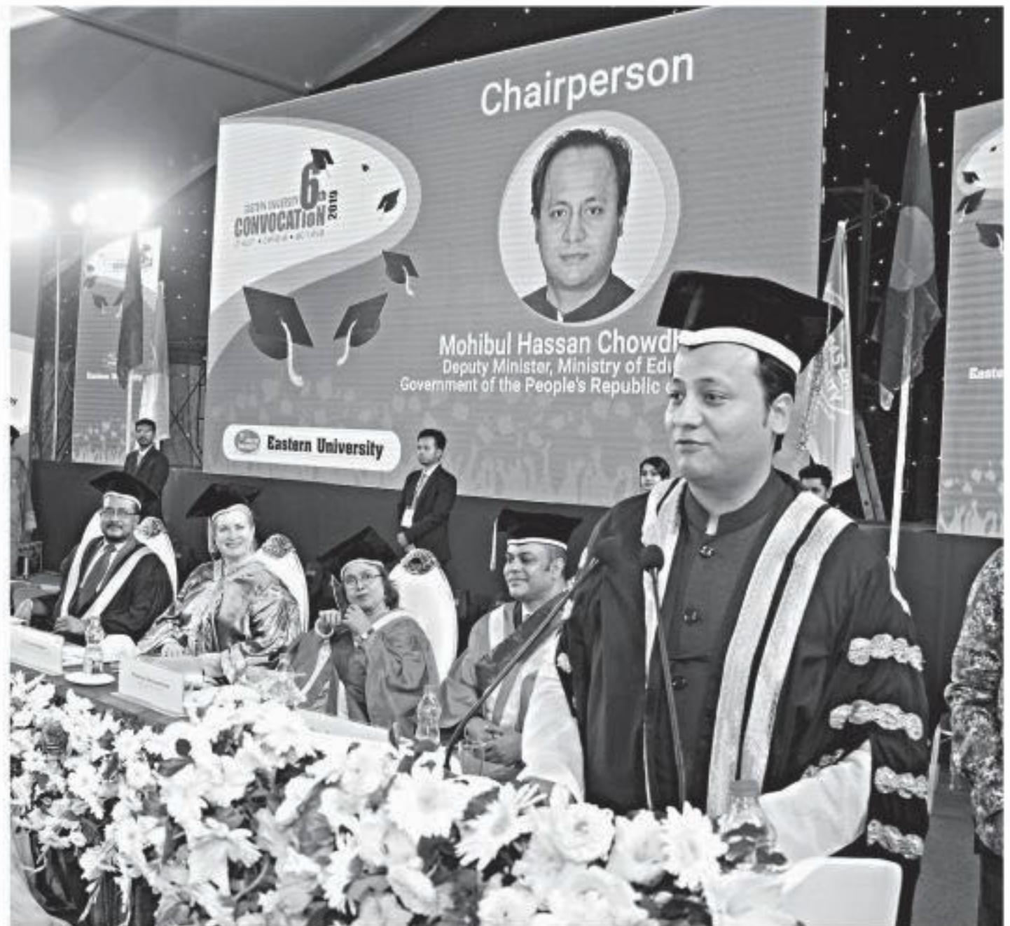
Deputy Minister for Education, Mohibul Hassan Chowdhury, speaks at Eastern University's sixth convocation yesterday.

FROM PAGE 3 on November 19, and Mathematics on November 24. PECE examinees will take Science on November 20 and Religion the next day; while madrasa students will take Arabic on November 20 and Quran Majid and Tajweed on November 21. Exams will start at 10:30am and end at 1pm every day. Children with special needs will be given extra 30 minutes. PECE was introduced in 2009 and its madrasa equivalent Ebtedayee was introduced in 2010.