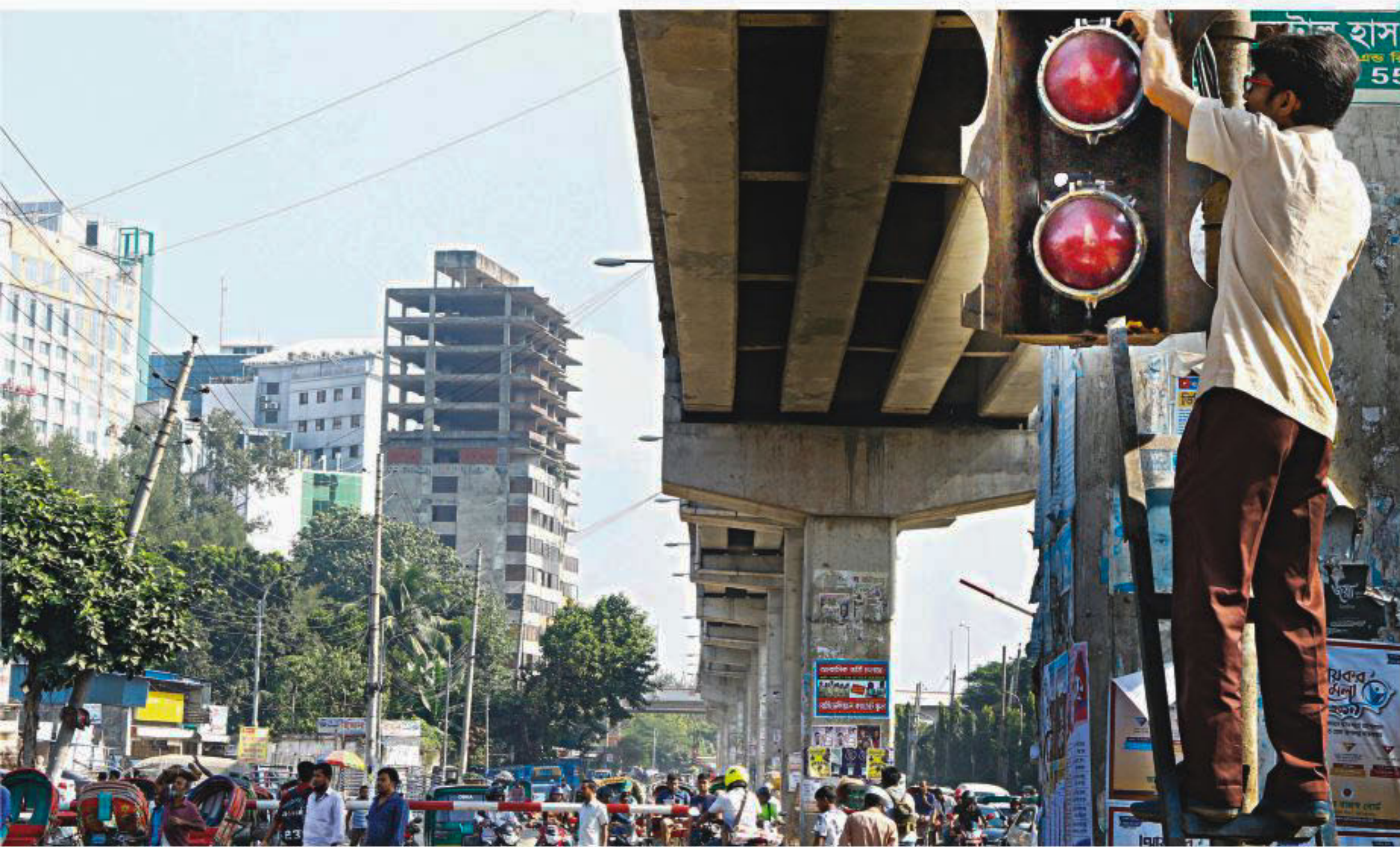
A worker installing a signal at Karwan Bazar level crossing yesterday. Railway took the initiative to ensure safety of people, who seem to be blissfully unaware of the danger and continue with their movement inside the barrier at the crossing.