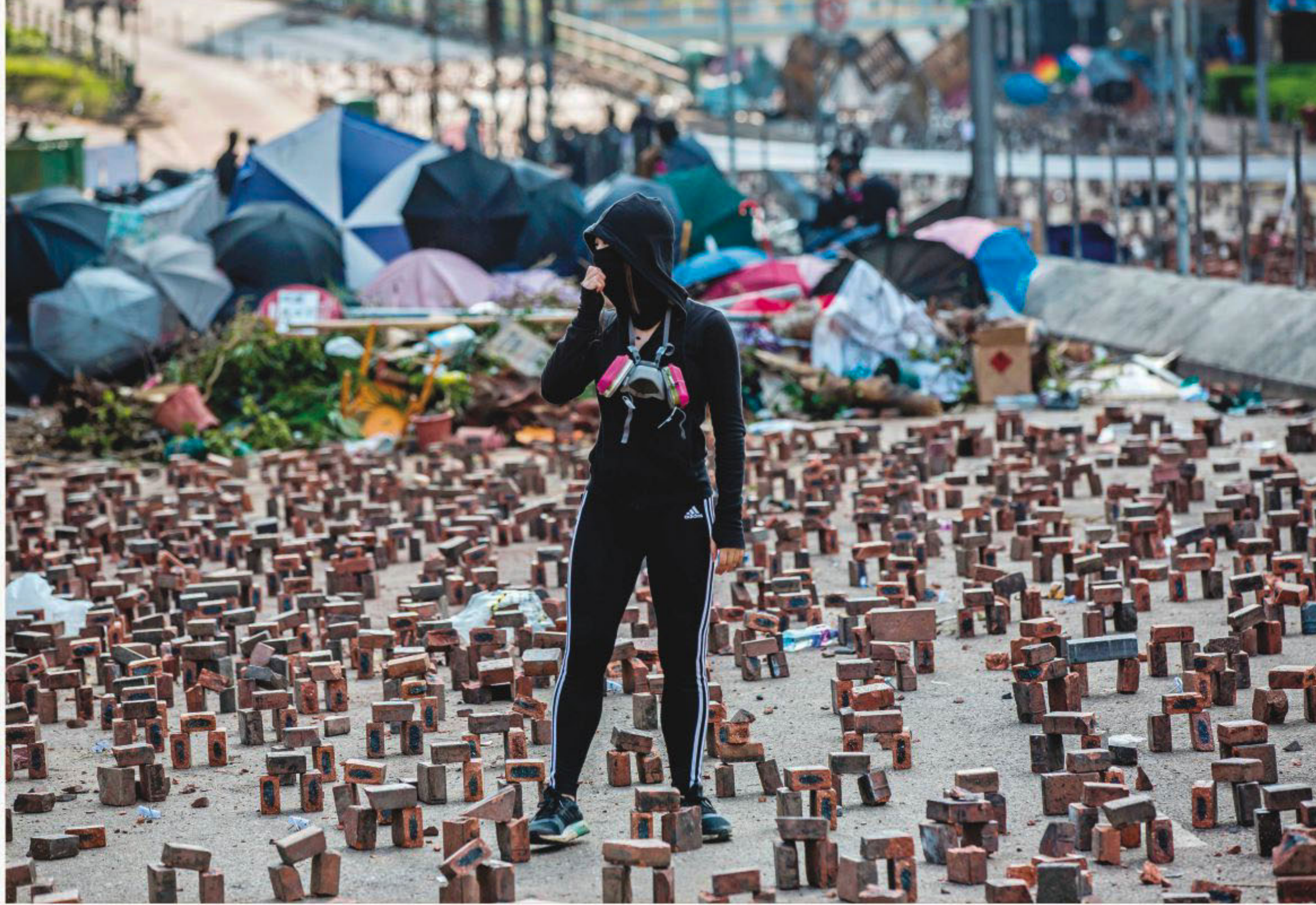
A pro-democracy protester stands amongst bricks placed on a barricaded street outside the Hong Kong Polytechnic University in Hong Kong yesterday.