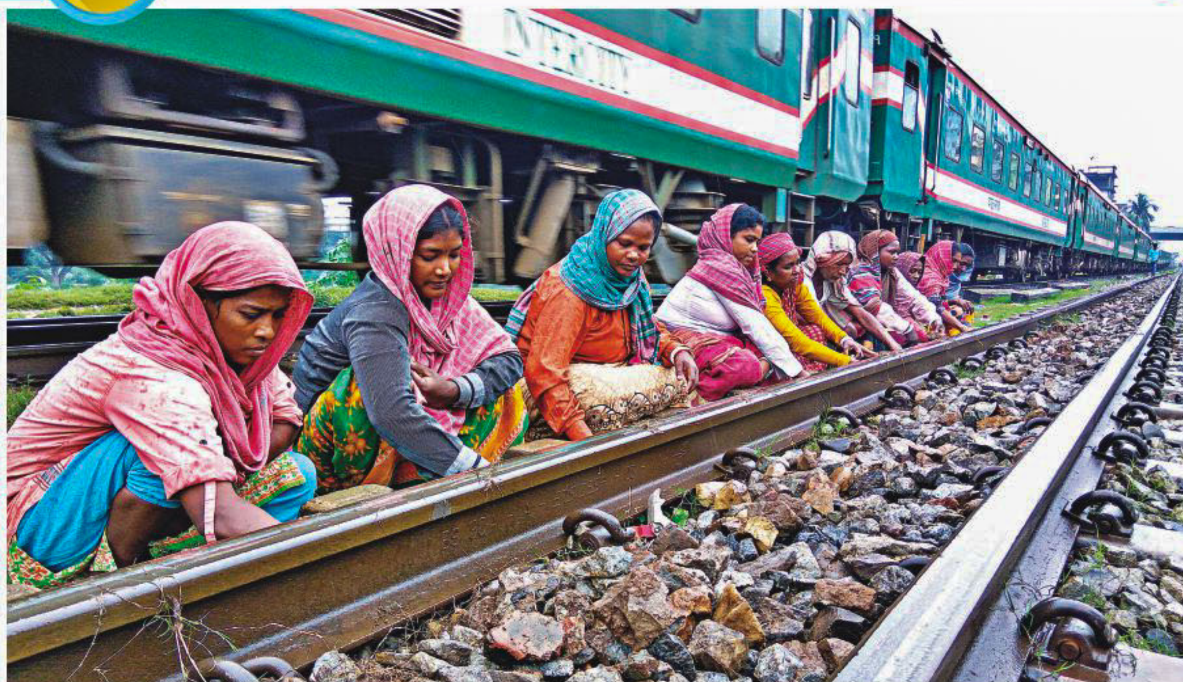
Sitting side by side, a group of Santal women put stones on track at Moghbazar to form the trackbed. They said a contractor brought around 40 of them from Niamatpur of Naogaon to Dhaka for the job. They are being paid Tk 500 per day. These women were mostly involved in farming back home and earned around Tk 300 per day but they took this opportunity for additional income. Duration of work on the 3km stretch of track is three months, and the women are staying in a makeshift shed beside it near FDC. The photo was taken recently.