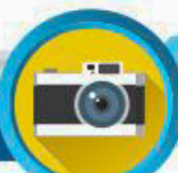
PHOTO OF THE DAY