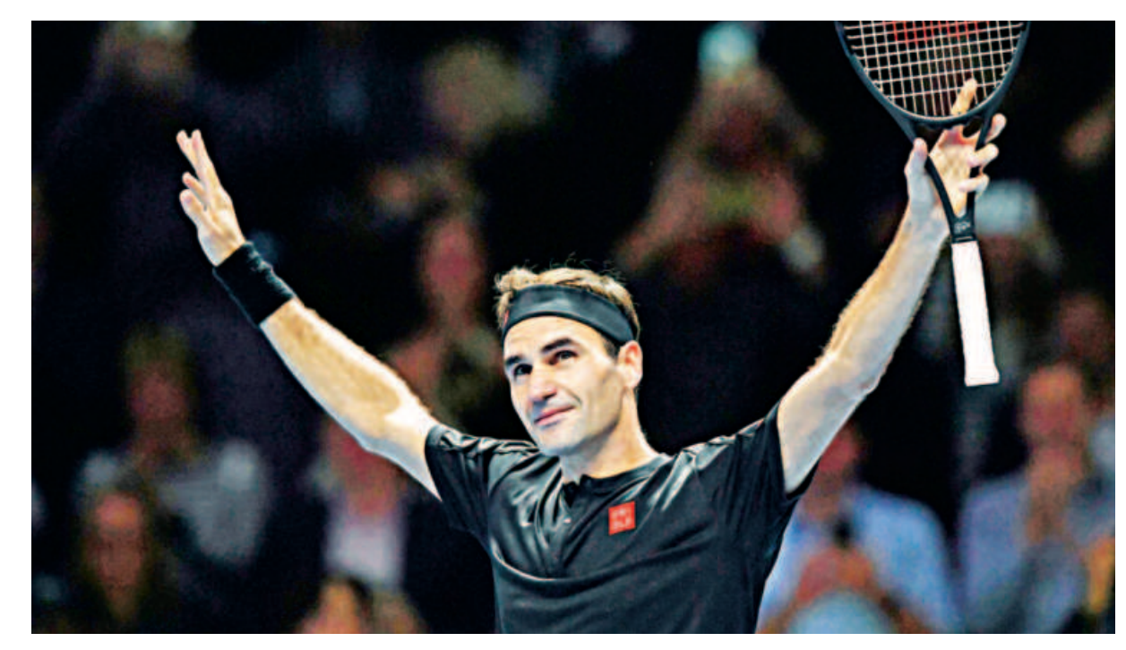
Roger Federer celebrates his straight sets victory over Novak Djokovic in the men's singles round-robin match of the ATP World Tour Finals at the O2 Arena in London on Thursday.

contribute to Ivory Coast's reforestation through helping awareness.