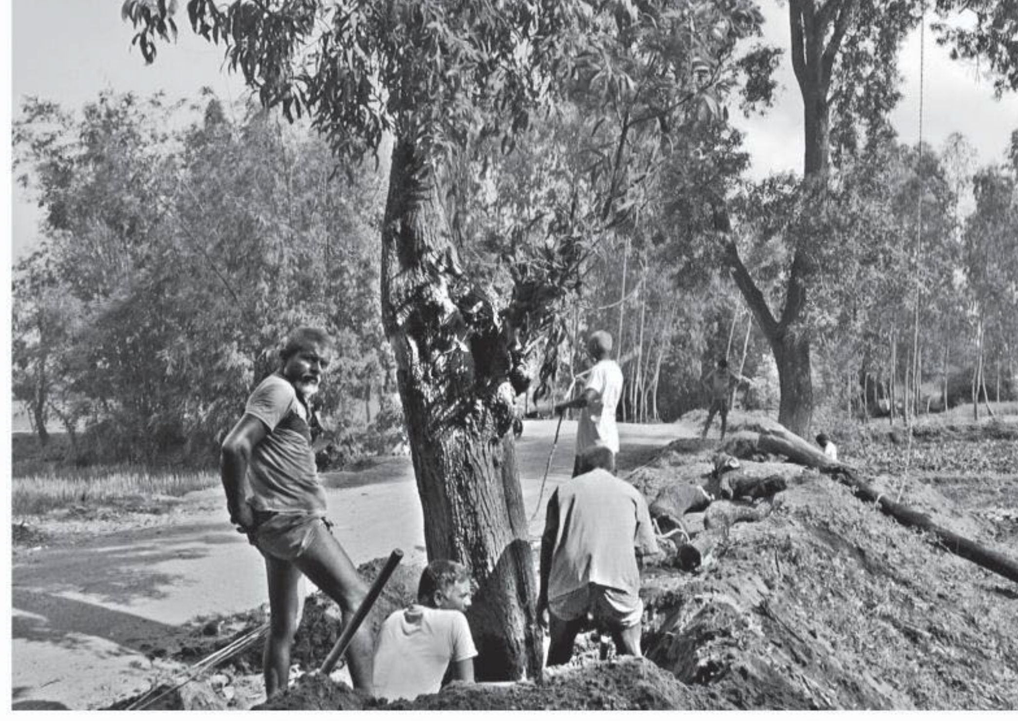
Workers fell trees beside Patgram-Dahagram road at Dahagram union in Lalmoinihat's Patgram upazila a few days ago.

Contacted, Forman Ali said his hired labourers are working to fell 1200 trees beside