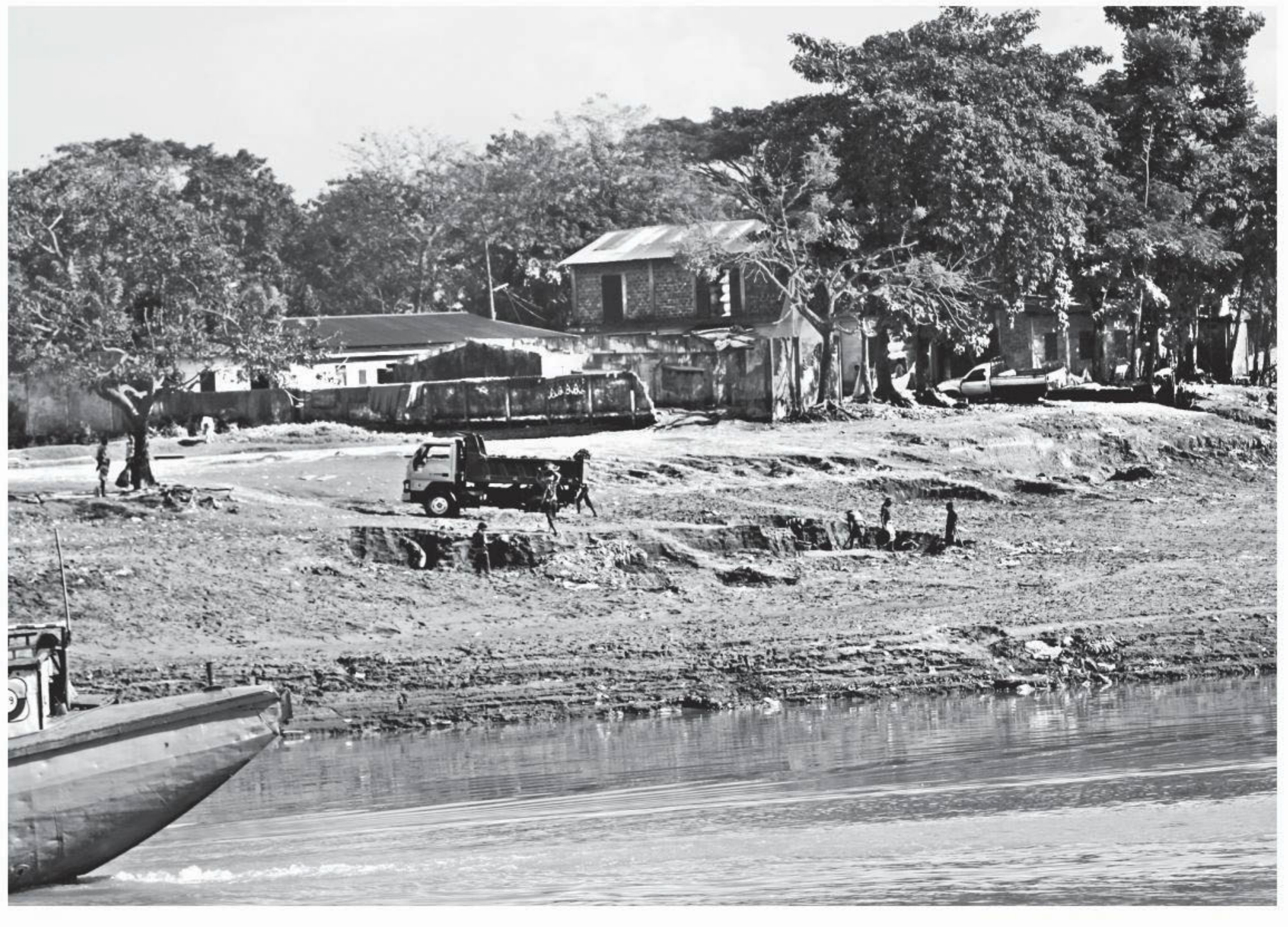
Unscrupulous traders extract earth from different places on the Surma river for sale to owners of brick kilns and realtors, posing risk of erosion in the nearby areas. The photo was taken from Gowaipara in Sylhet city yesterday.

The arrestees were later produced before a court in Thakurgaon, said the DD.